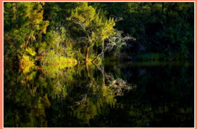
Highly Commended Waterways - Open Edwin Lim