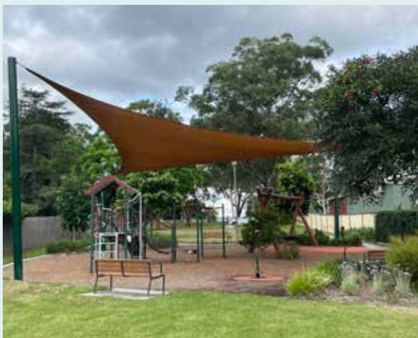
Pindari Reserve, Camden South

This project was funded by Council and the Australian Government's Local Roads and Community Infrastructure Program.