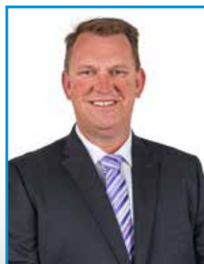
Deputy Mayor Cr Paul Farrow