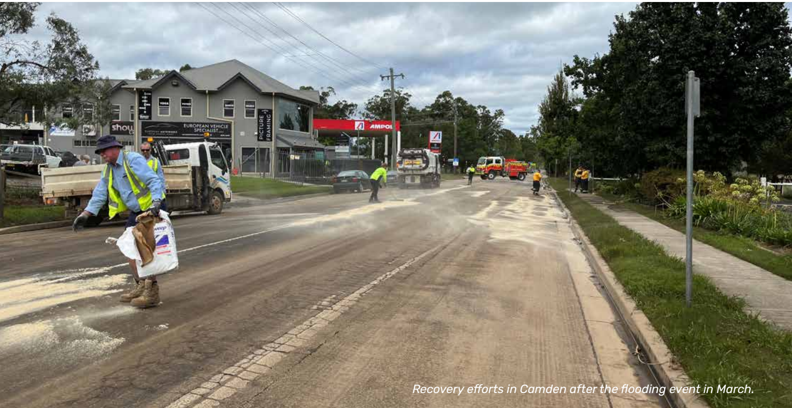
Recovery efforts in Camden after the flooding event in March.