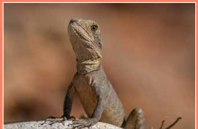
Highly Commended Native Fauna - Open Debbie Simmonds