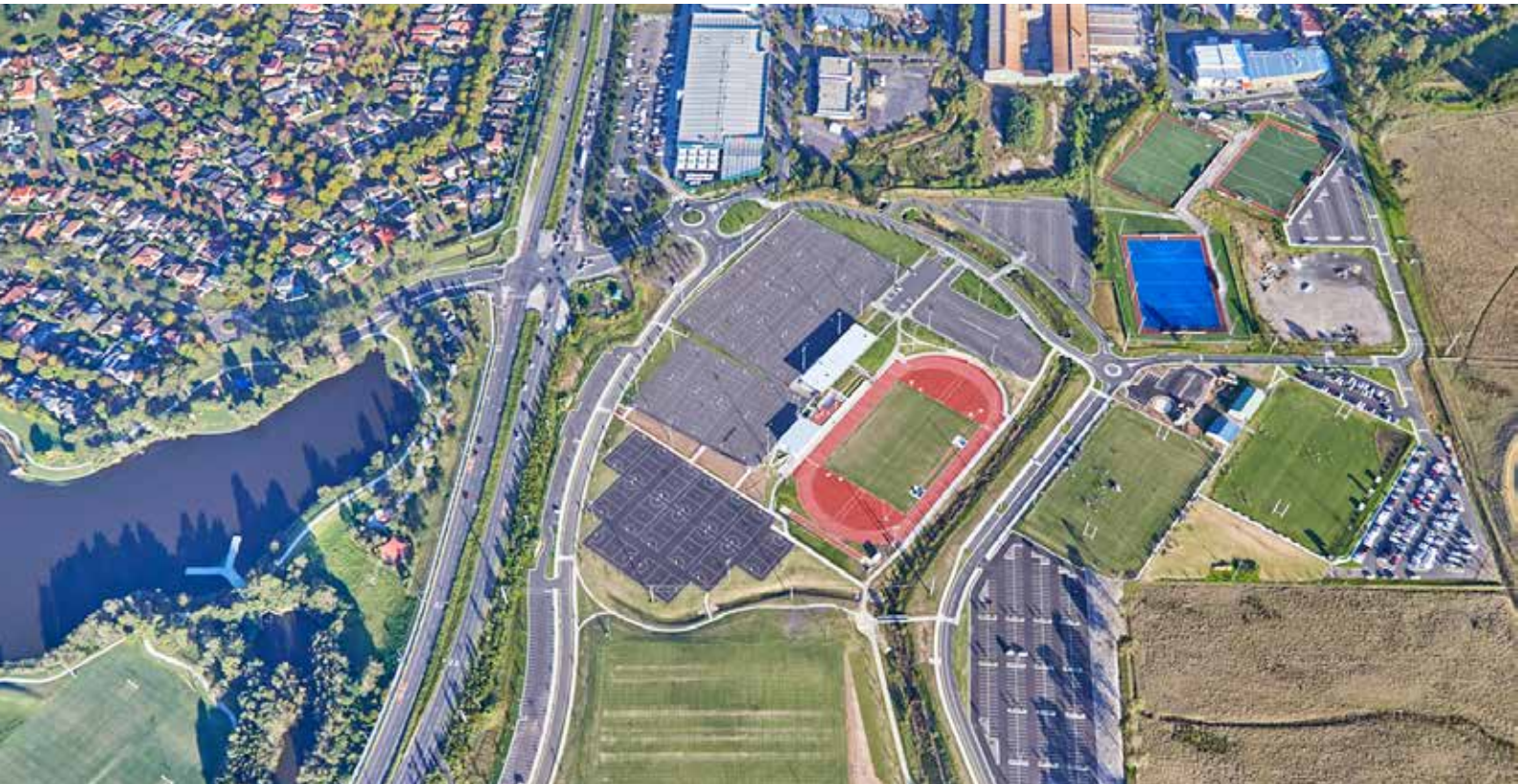
Aerial shot of Narellan Sports Hub