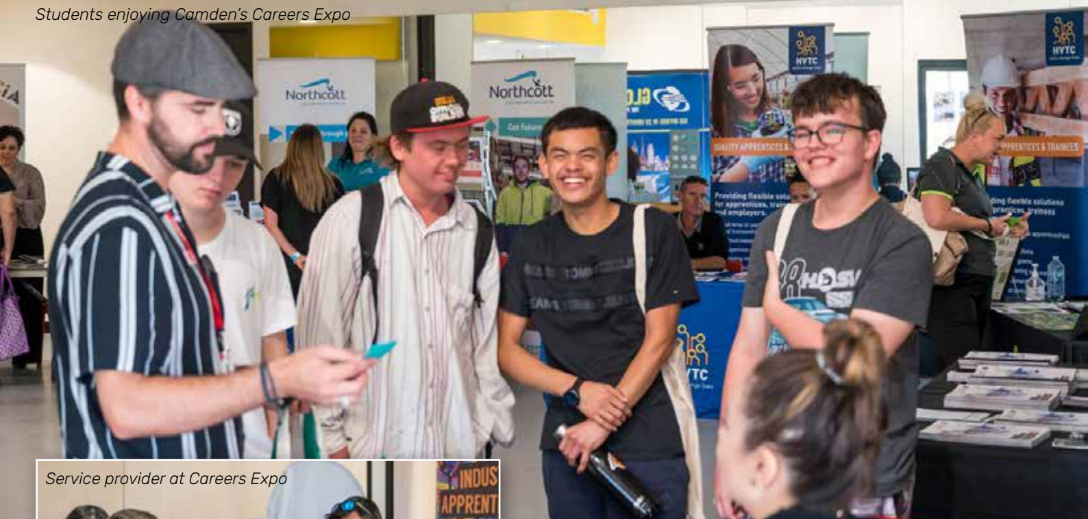
Service provider at Careers Expo