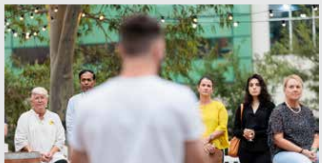
Local business owner shares his experiences