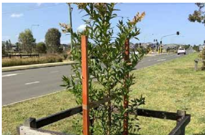
Street tree in Camden

This project is part of the Greening our City grant program, funded by the NSW Government in association with Local Government NSW.