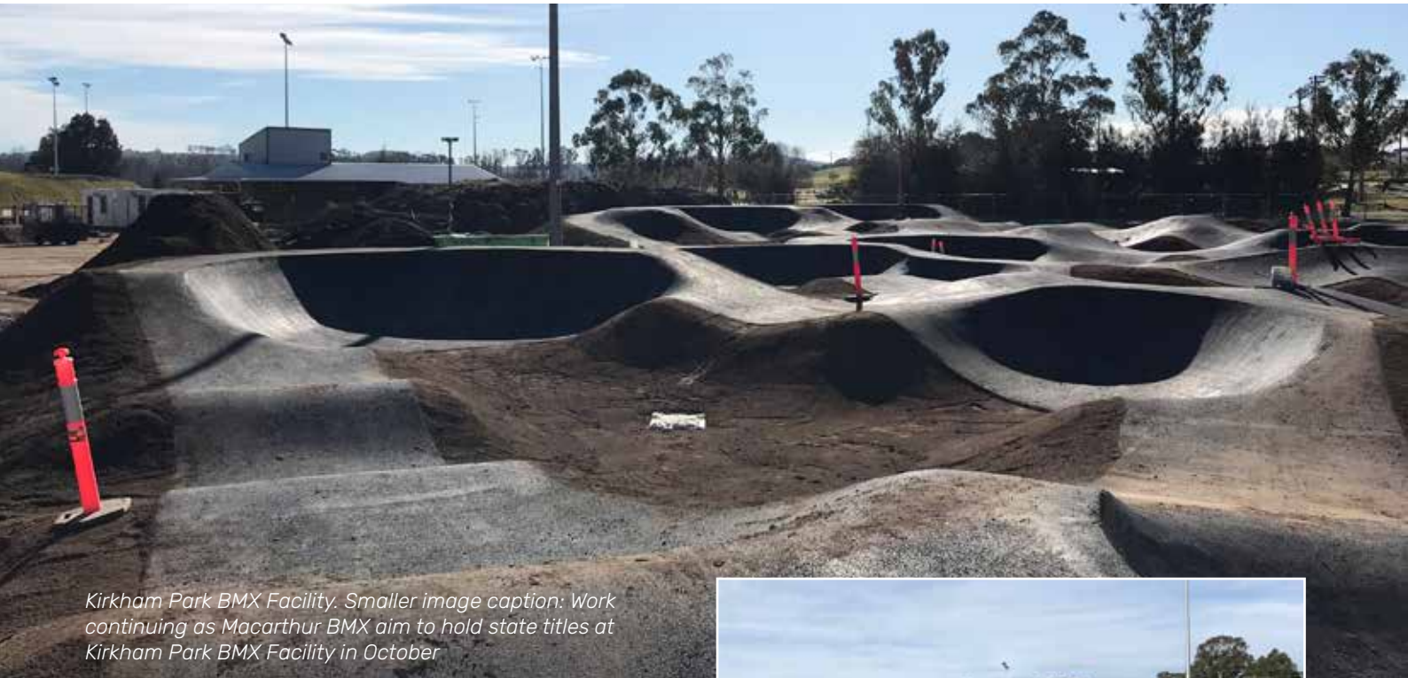
Kirkham Park BMX Facility. Smaller image caption: Work continuing as Macarthur BMX aim to hold state titles at Kirkham Park BMX Facility in October