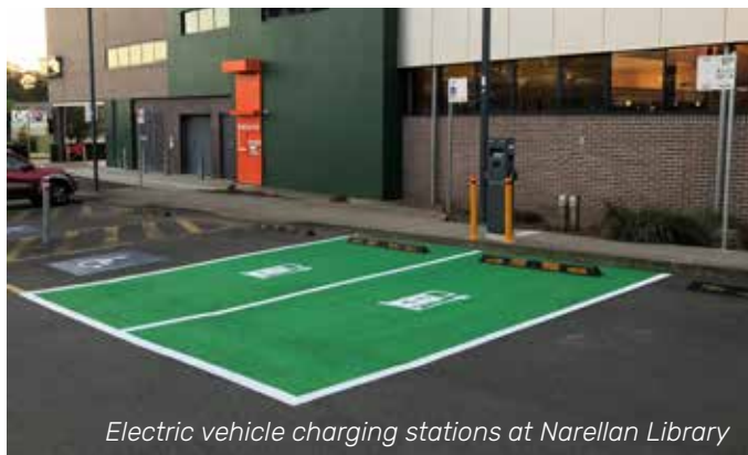
Electric vehicle charging stations at Narellan Library