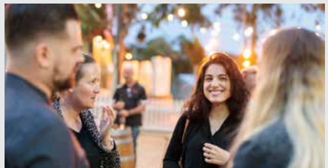
Networking at Small Business Month Pop-up Event

The program highlight was Council's first Pop-Up Panel event on Thursday 24 March. The event saw three local businesses, Burger Frank, Help2u Pty Ltd and Performance Personal Training, share how a range of adaptations and innovations benefited their businesses over the last two years.