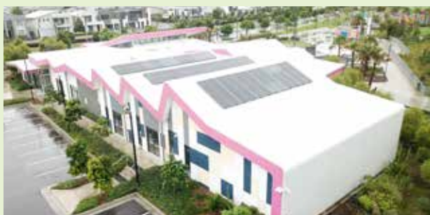
Julia Reserve Youth Precinct

Want to find out what sustainability programs Council is running? Visit camden.nsw.gov.au/environment/sustainable-living/