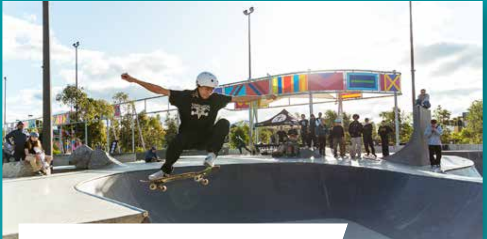
Julia Reserve Skate Comp Series