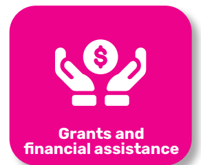
Grants and financial assistance

Grants and financial assistance, with more than $350,000 available to residents and businesses;