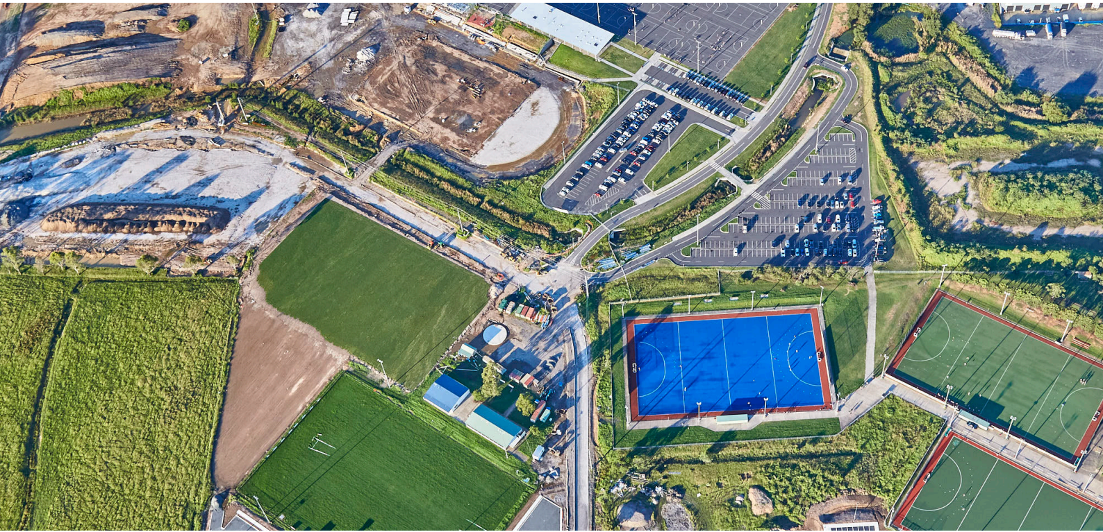
Aerial shot of Narellan Sports Hub