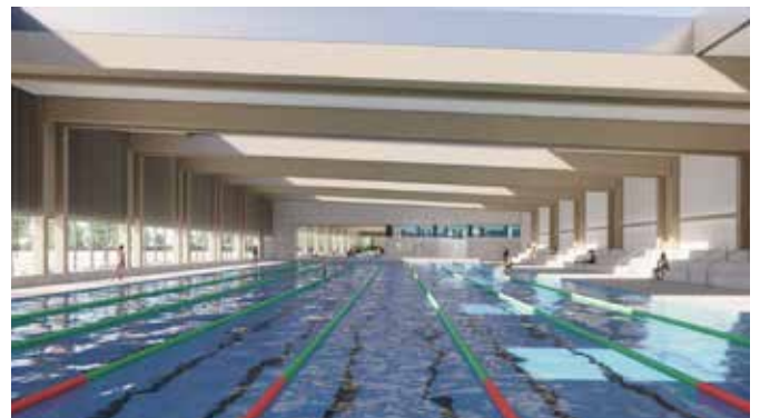
Artists impression of the Oran Park Leisure Centre pool

"Council has worked hard on providing the community with high quality sport and recreation facilities across the Camden area and Oran Park Leisure Centre will add to our growing list," she said.