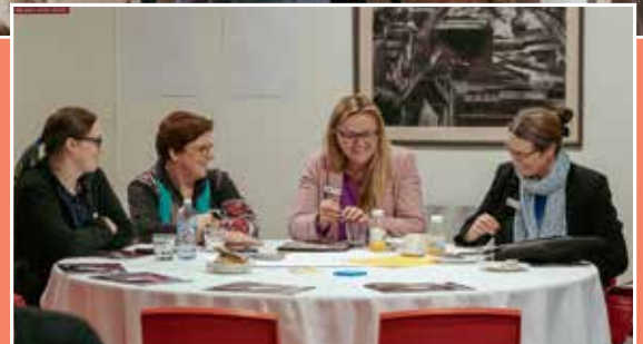
Creative Collab was a hit with local creatives