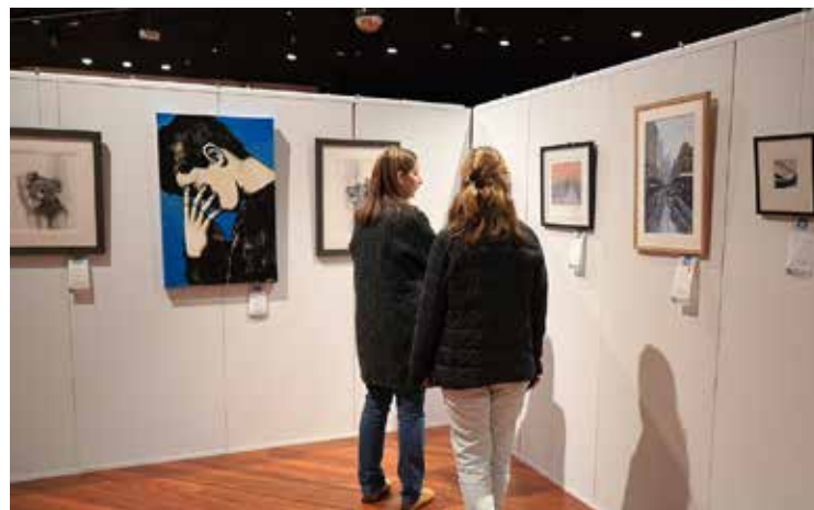
Visitors enjoying Camden Art Sale

The next exciting exhibition to take the Alan Baker Art Gallery by storm will be Baker's Bouquets. For more information on this, and for other events, visit camden.nsw.gov.au/community/