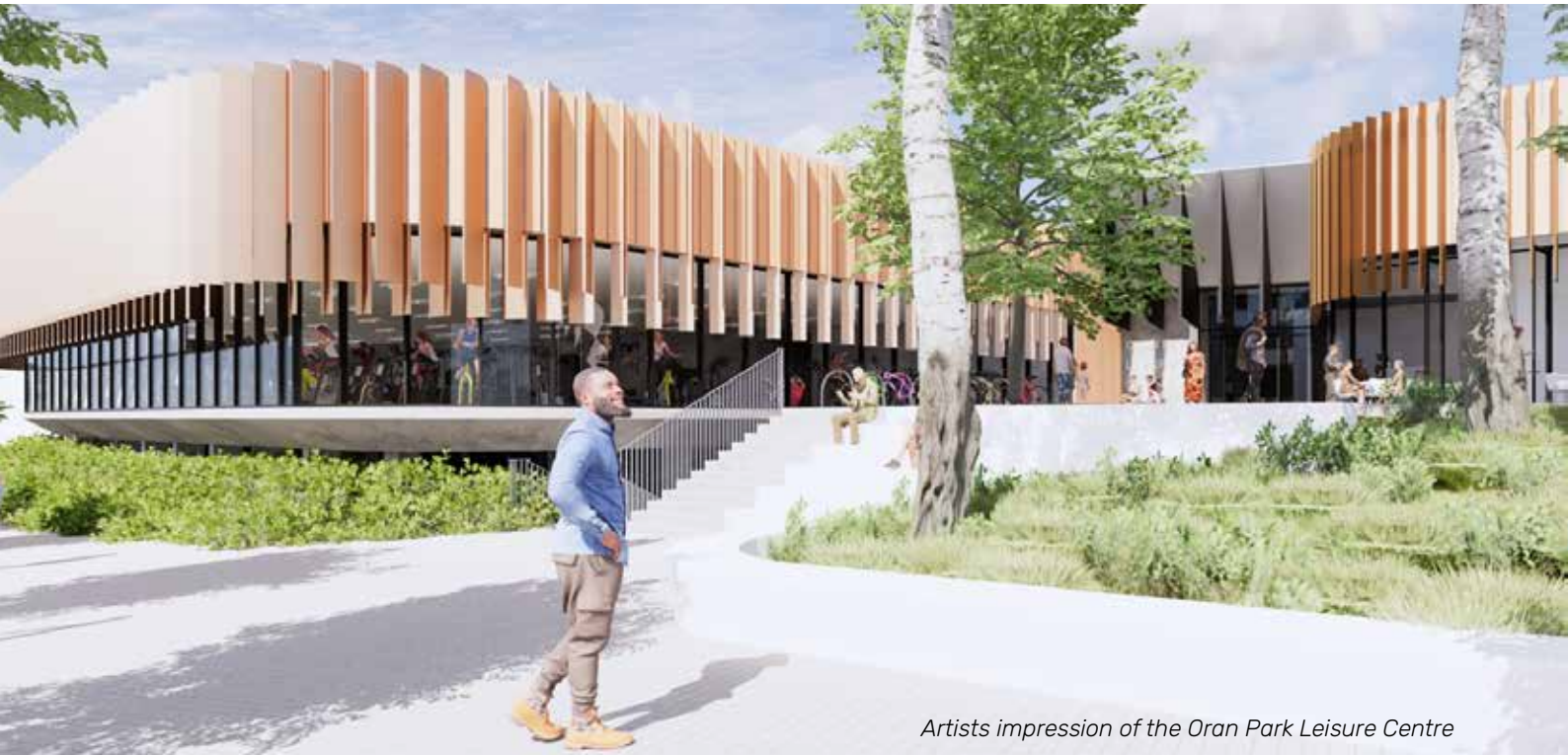
Artists impression of the Oran Park Leisure Centre