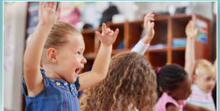
Camden Libraries Holiday Programs