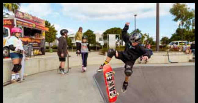
Action from the first Skateboard, Scooter and BMX Jam

For more information, and to register for the next sessions, visit bit.ly/JR-Skate-Comp-Series