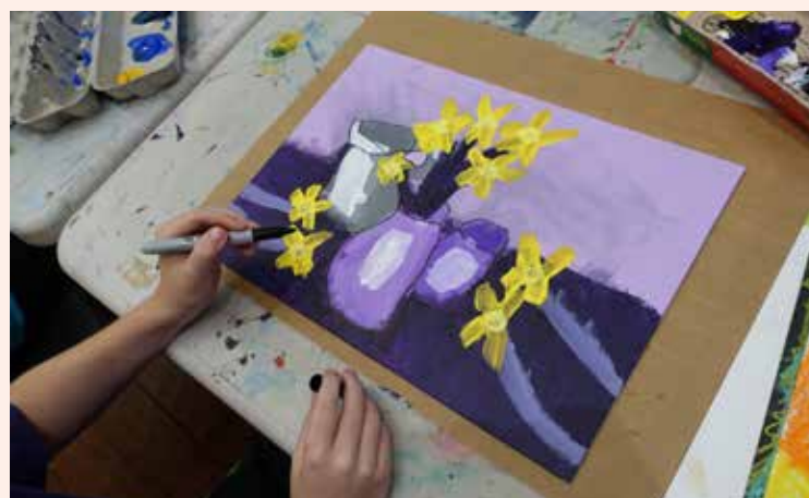
Join us for a creative workshop

If you're interested in unleashing your inner artist, be sure to check out our ongoing Public Program at alanbakerartgallery.com.au