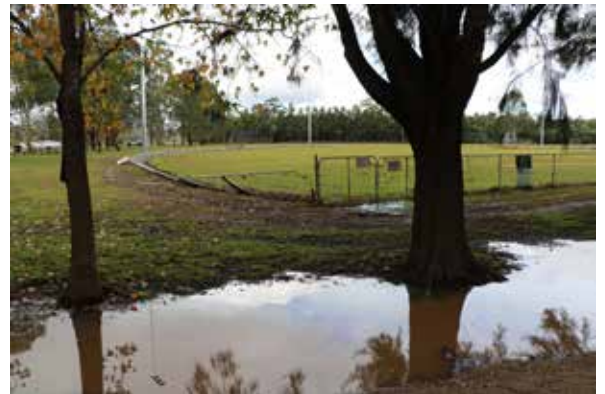
Softball fields during July flooding

For more information on Flood Plain Management in Camden, go to camden.nsw.gov.au