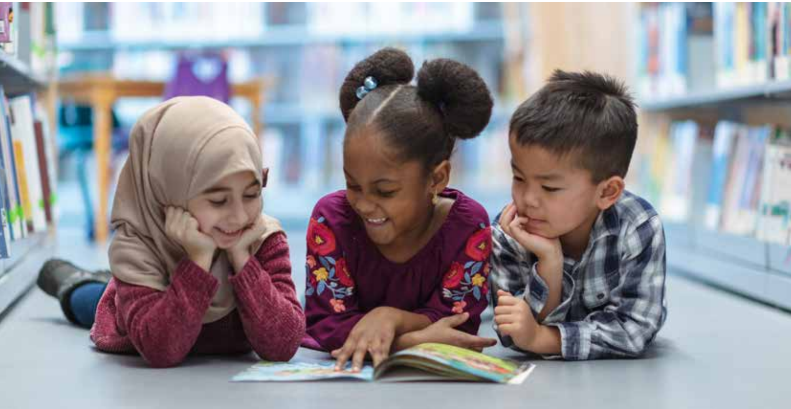
Kids enjoying a book