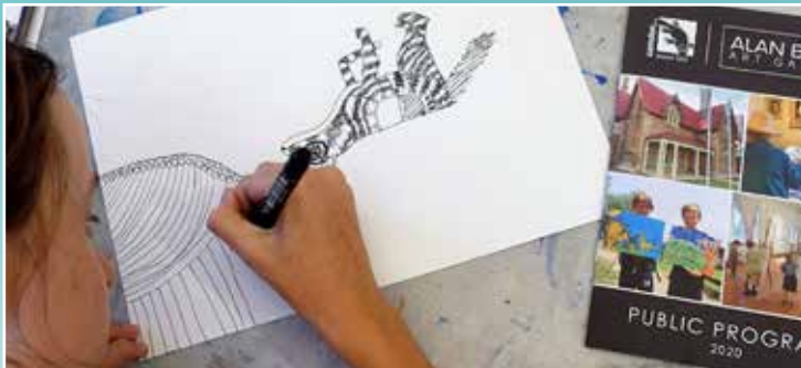
Alan Baker Art Gallery Holiday Programs