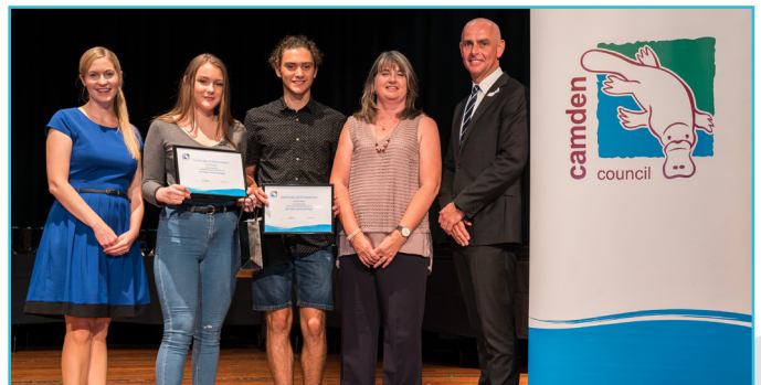
Camden High School Achievers