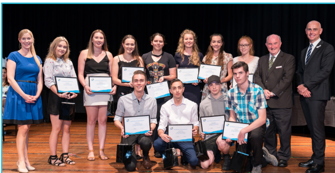
St Benedict's Catholic College Achievers