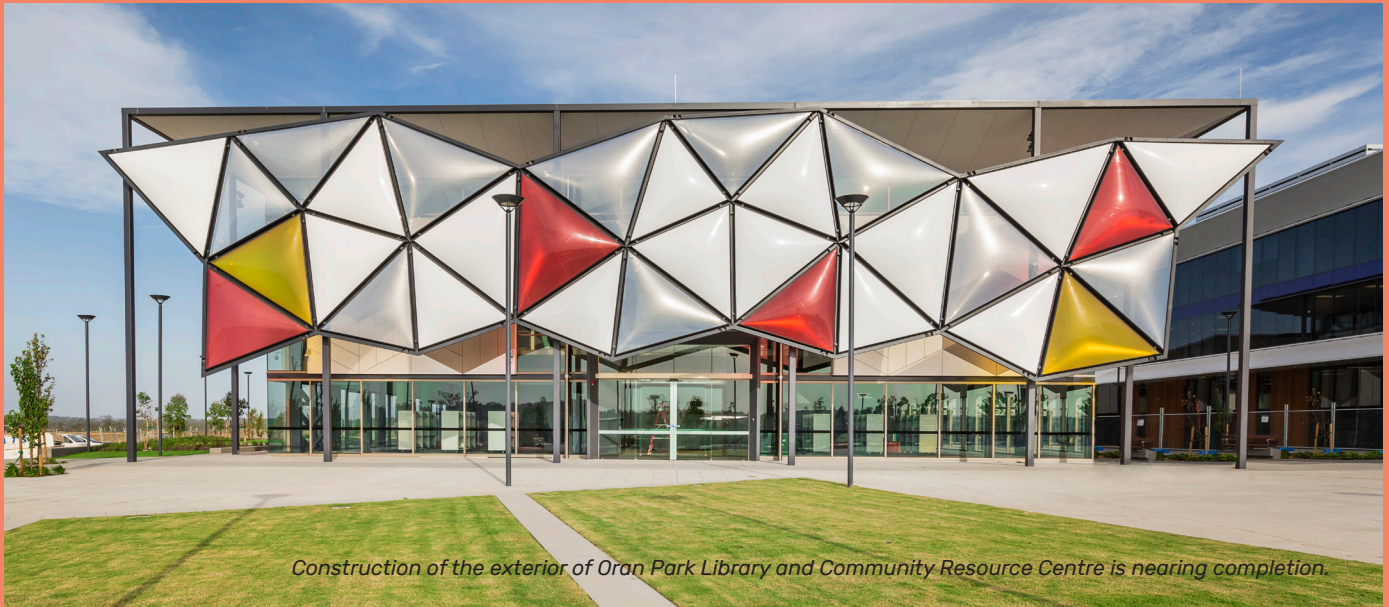
Construction of the exterior of Oran Park Library and Community Resource Centre is nearing completion.

For further information on the project visit camden.nsw.gov.au/major-developments