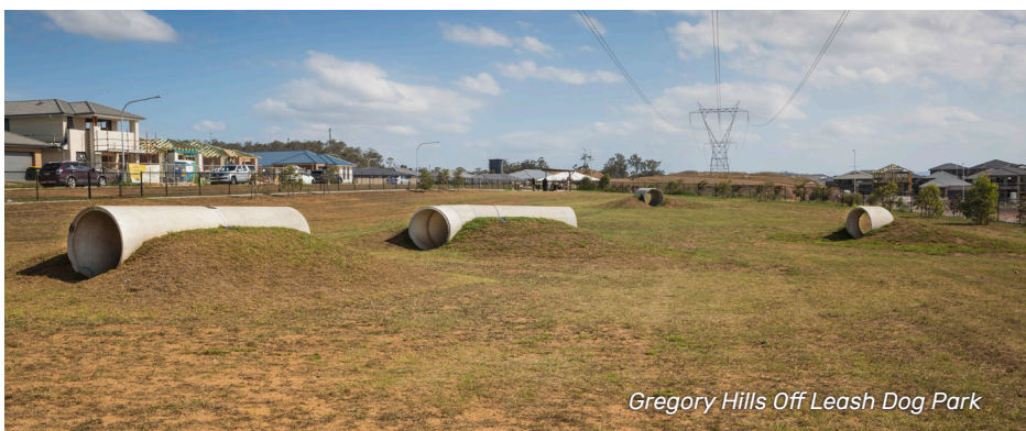
Gregory Hills Off Leash Dog Park

For more information on pet ownership visit our website camden.nsw.gov.au and search for 'pets' or call Council on 4654 7777 .