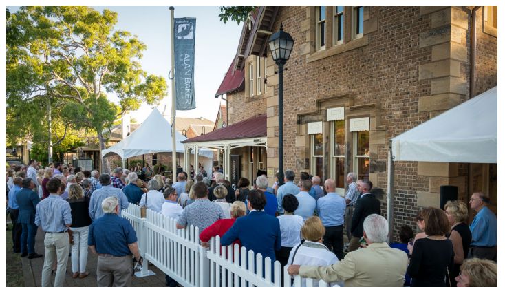
Official Gallery opening