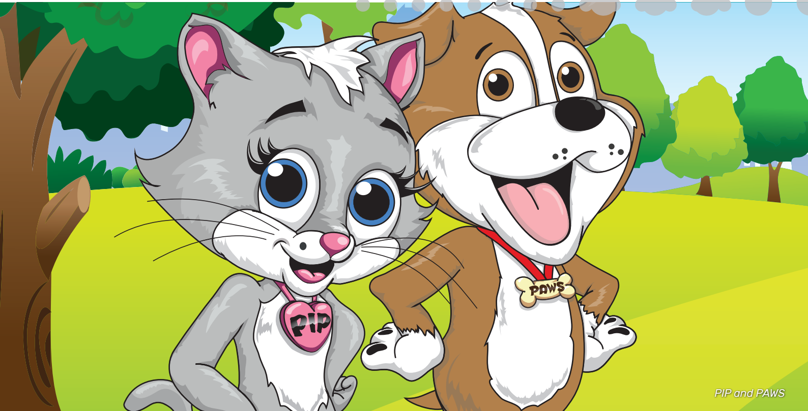
PIP and PAWS