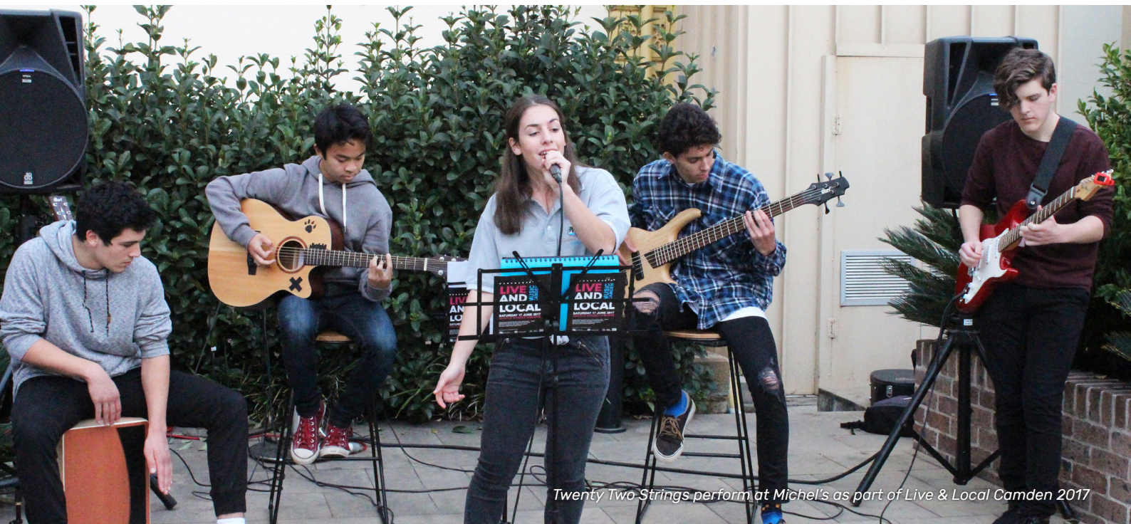
Twenty Two Strings perform at Michel's as part of Live & Local Camden 2017