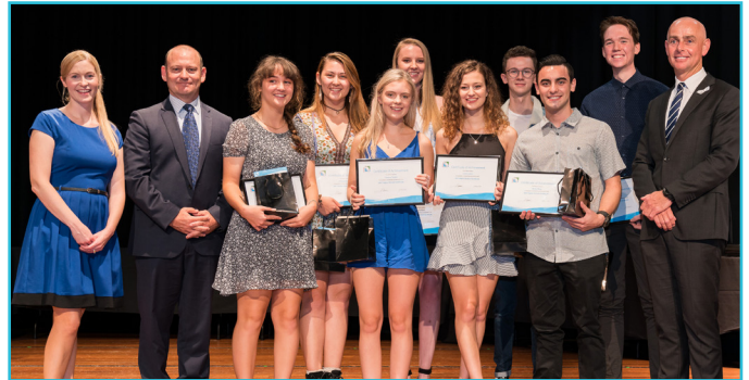
Magdalene Catholic High School Achievers