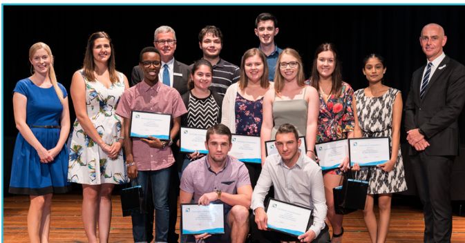
Mount Annan High School Achievers