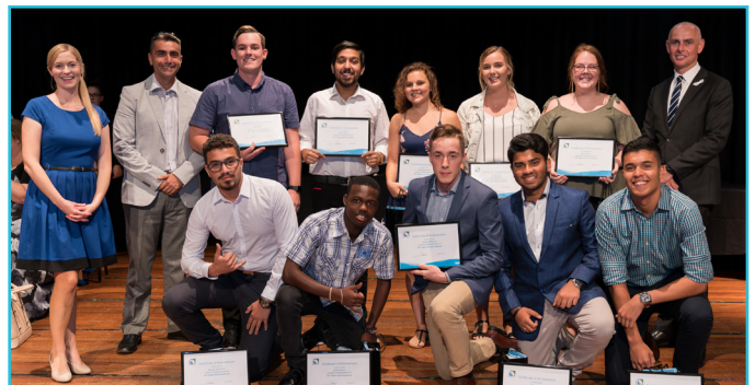
Mount Annan Christian College Achievers