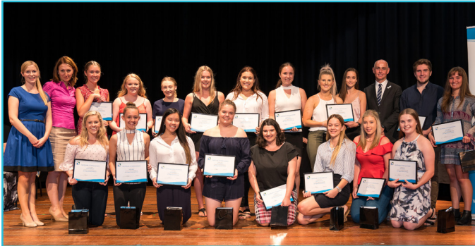
Elderslie High School Achievers