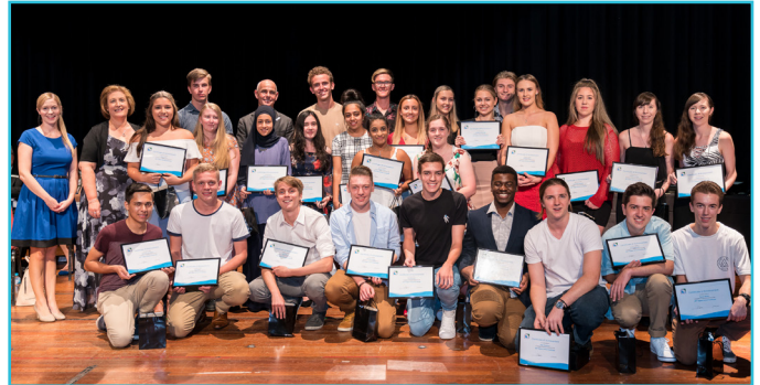
Elizabeth Macarthur High School Achievers