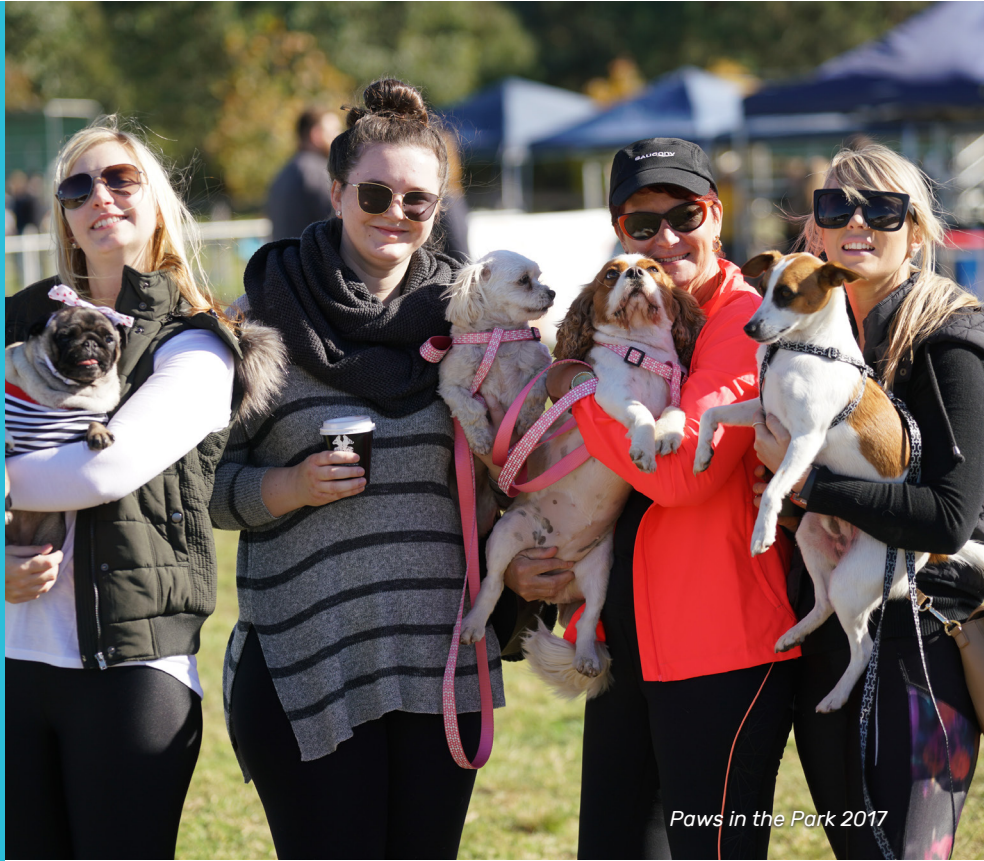
Paws in the Park 2017