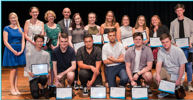
Macarthur Anglican High School Achievers