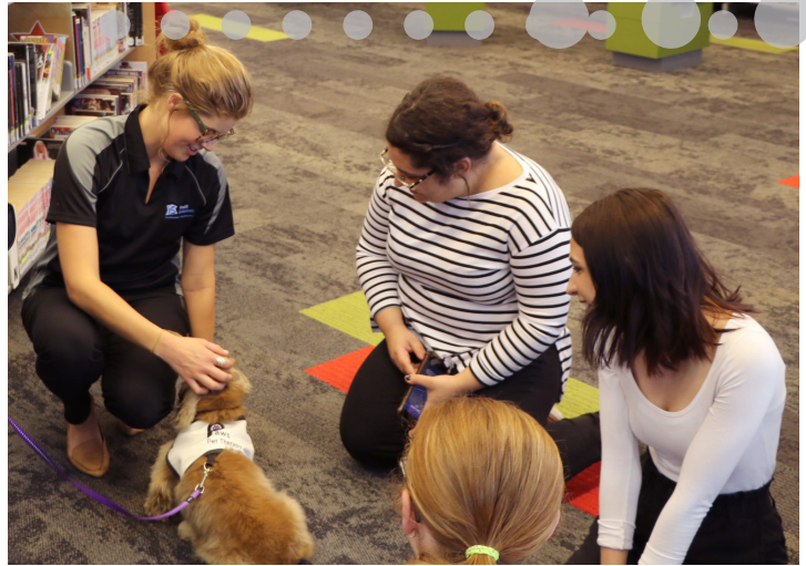
Year 12 high school students enjoying a visit from Banjo.

This is a partnership program driven by Council's Youth Services with PAWS Pet Therapy and the Camden Youth Council. For more information call 4645 5021.