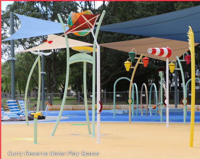
Curry Reserve Water Play Space

The new youth play space will expand on the existing young children's playground and will feature new playground equipment including a recessed trampoline, climbing equipment, musical equipment and natural play elements to enhance the diversity of play experiences.