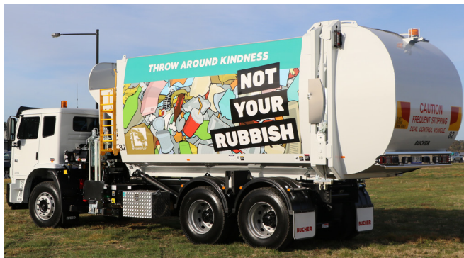
New anti-bullying signage on Council's waste trucks, designed by young people living in Camden.

These trucks will join the fleet of waste collection vehicles that display signage to raise awareness of mental health, suicide prevention and domestic violence. Keep an eye out for these messages on your bin collection day.