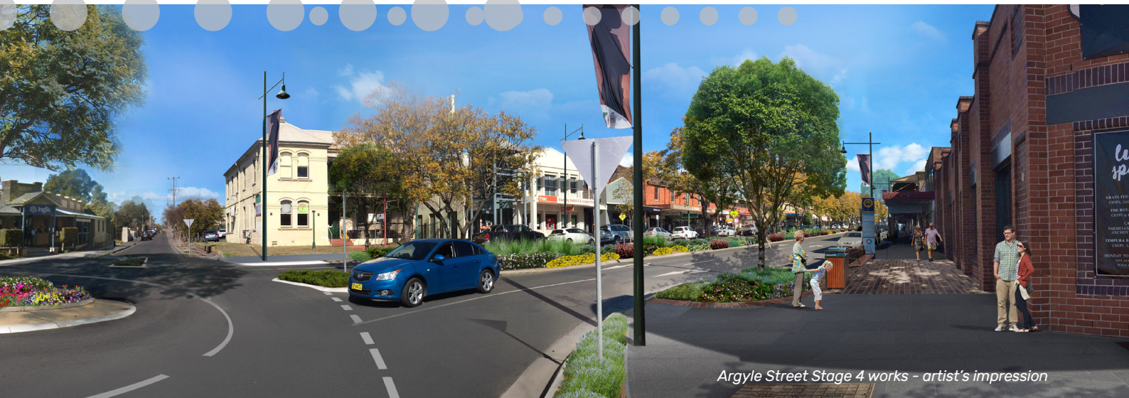
Argyle Street Stage 4 works - artist's impression