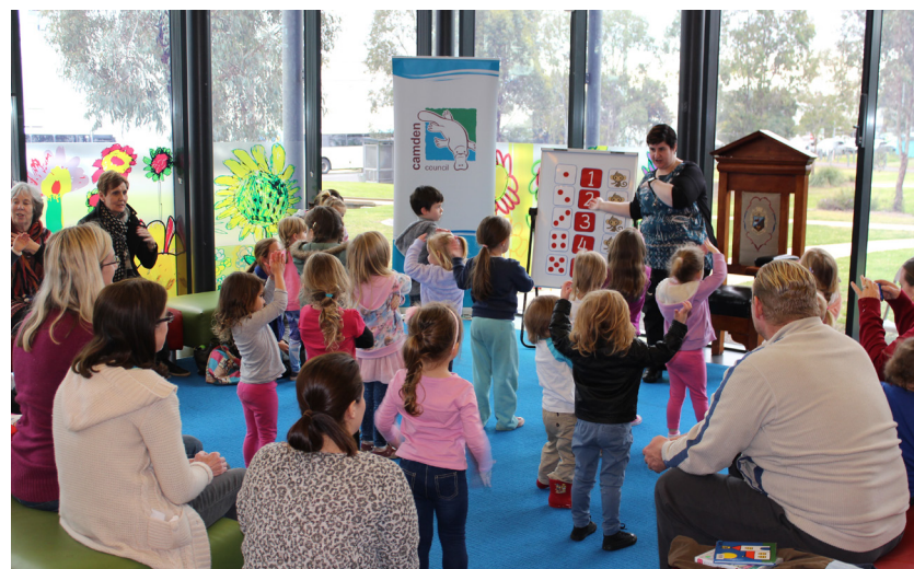
Storytime at Narellan Library