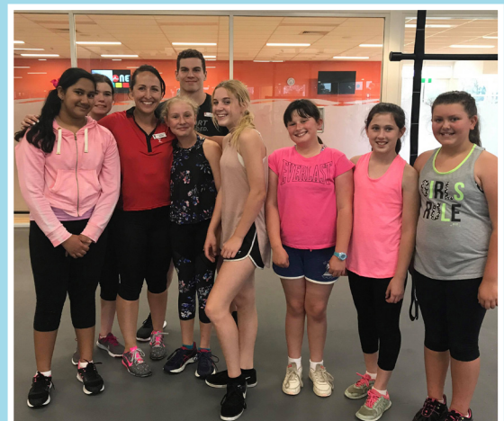
Young people across Camden enjoyed many activities on offer as part of Youth Week 2018.

The announcement was made at the NSW Local Government Awards, where Council was selected as a finalist for the eighth consecutive year.