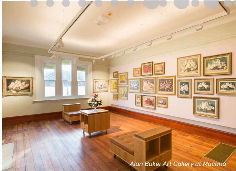
Alan Baker Art Gallery at Macaria

For more information phone 4645 5191 or visit www.alanbakerartgallery.com.au