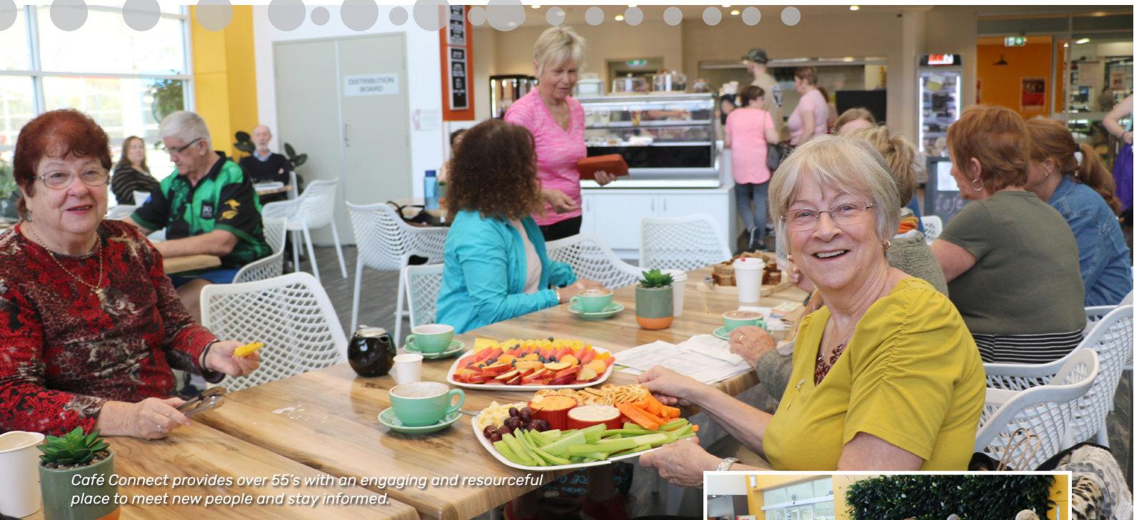
Café Connect provides over 55's with an engaging and resourceful place to meet new people and stay informed.