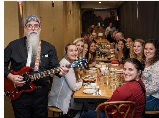
Live music performance at Upstairs at Freds as part of the Jacaranda Festival.