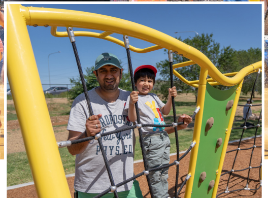
Harrington Park Lake Youth Play Space.