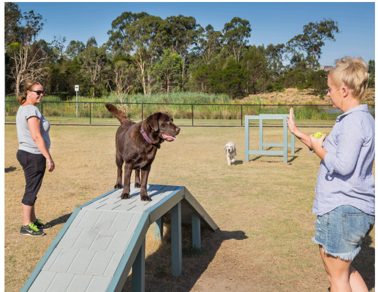
Off-leash dog park Burrell Road, Spring Farm.

Remember: When you're taking your dog for a walk, your pet MUST be on a lead for the safety of everyone in our community.