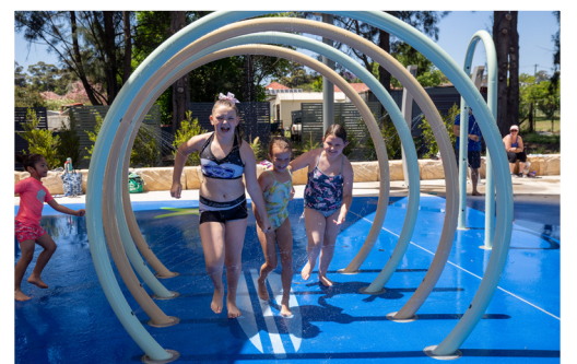
Curry Reserve Water Play Space.