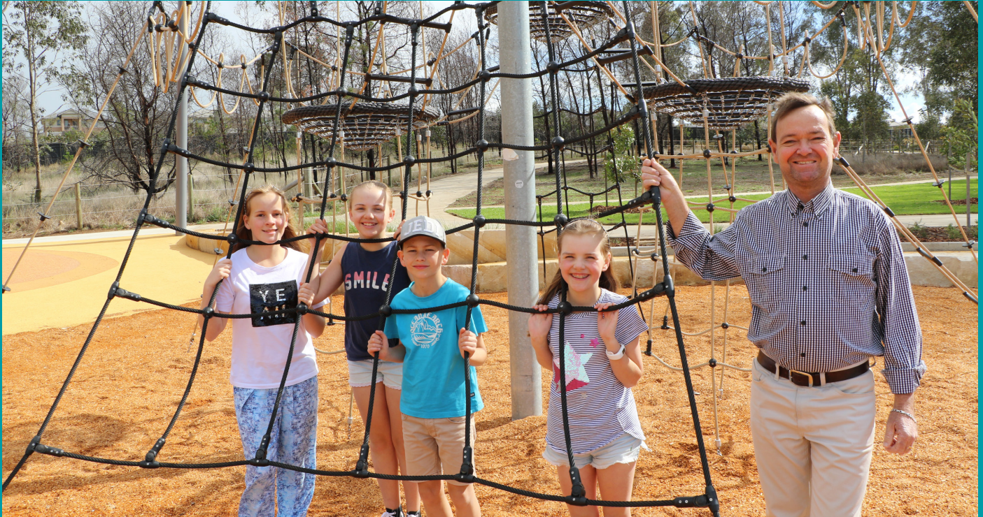
Mayor of Camden, Cr Peter Sidgreaves with children at the new park at Bandara Circuit Park, Spring Farm.