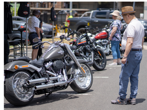
Motorcross and car display in Larkin Place, Camden as part of the Jacaranda Festival.