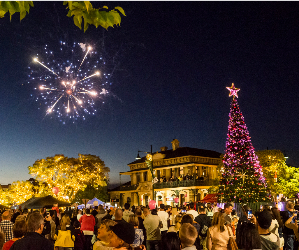
The Camden community Christmas Tree and fairy lit Jacaranda trees along Argyle Street in Camden Town Centre.

The decorative lights, which were lit for the first time at the Camden Jacaranda Festival, enliven the streetscape at sundown, encourage people to visit and dine after hours, as well as build on the prosperity of the Town Centre.