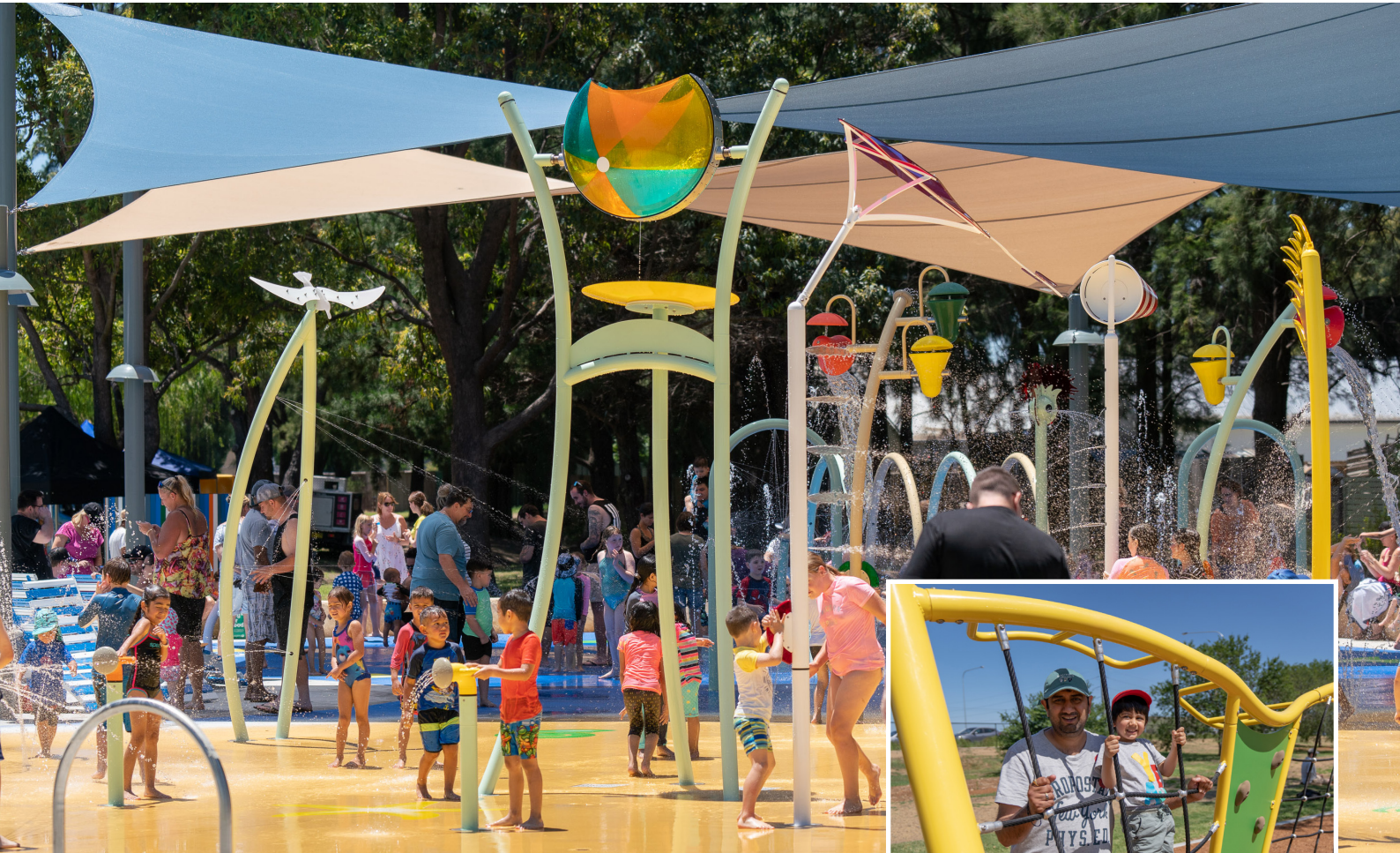
Curry Reserve Water Play Space.