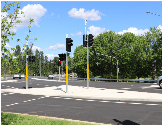
The upgraded Camden Valley Way and Macarthur Road intersection.

For more information go to www.camden.nsw.gov.au