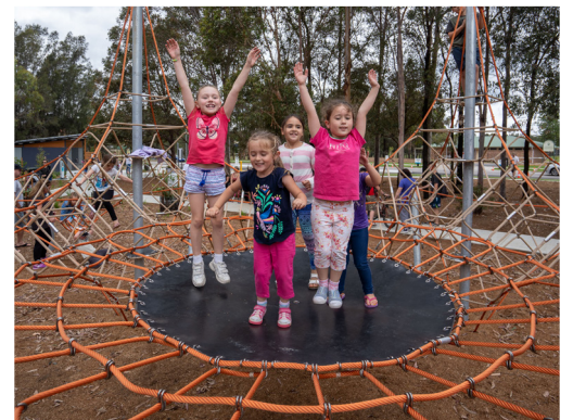
Sedgwick Reserve Youth Play Space.

For more information go to www.camden.nsw.gov.au