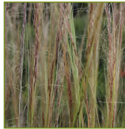
Mexican Feather Grass