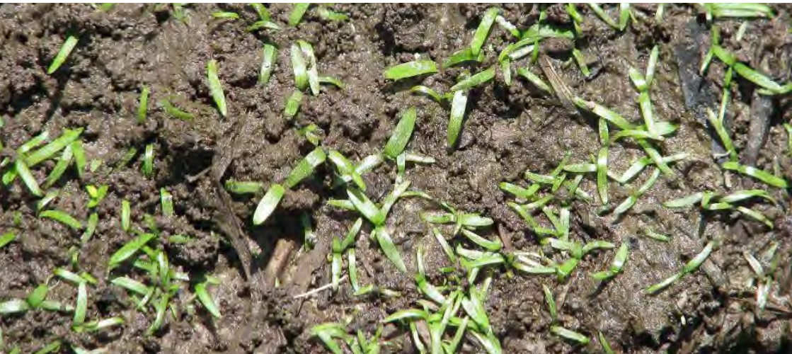
Seedlings have a narrow leaf and germinate in the mud.