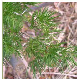
Ming Asparagus Fern