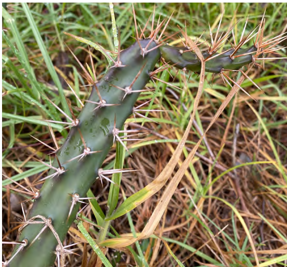
Tiger pears' sharp spines are up to 5cm long.