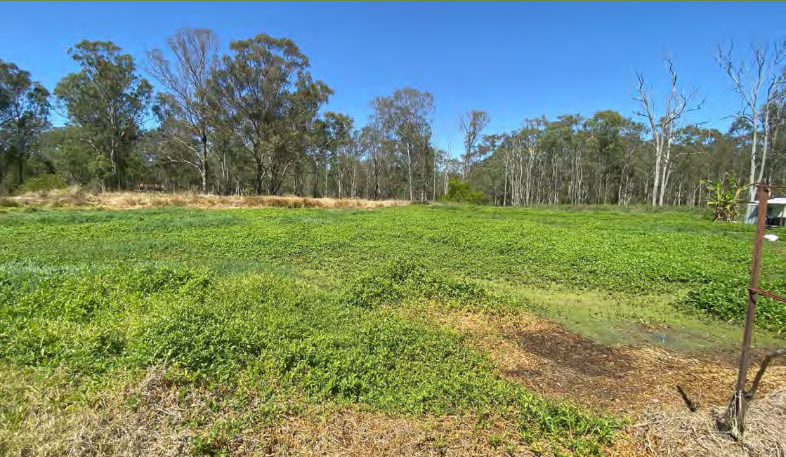
Mature alligator weed covering a dam.