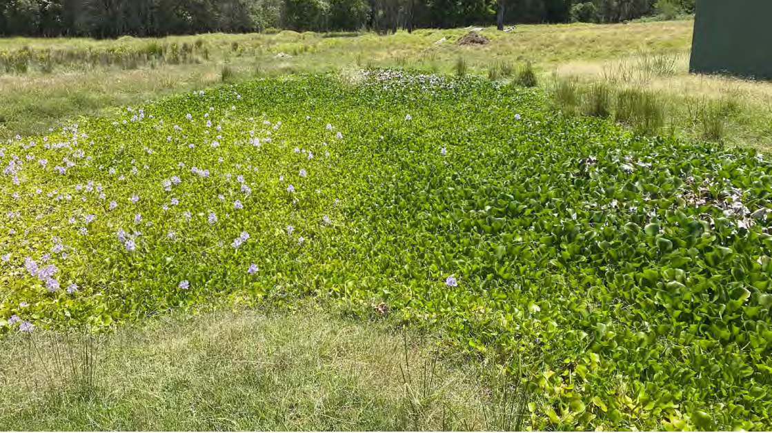
Mature Water hyacinth floating on water surface.