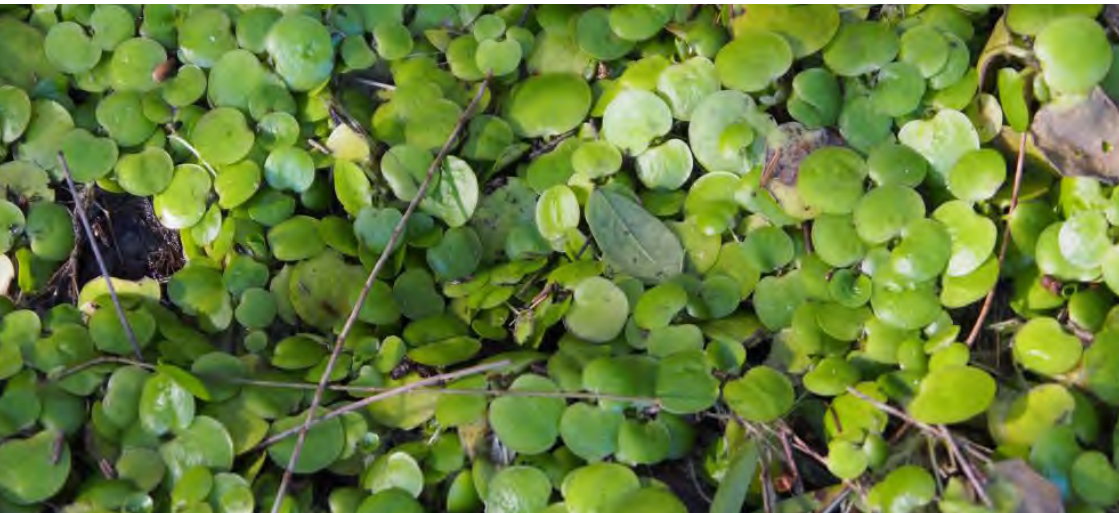
Floating plants form a thick mat on the water surface.