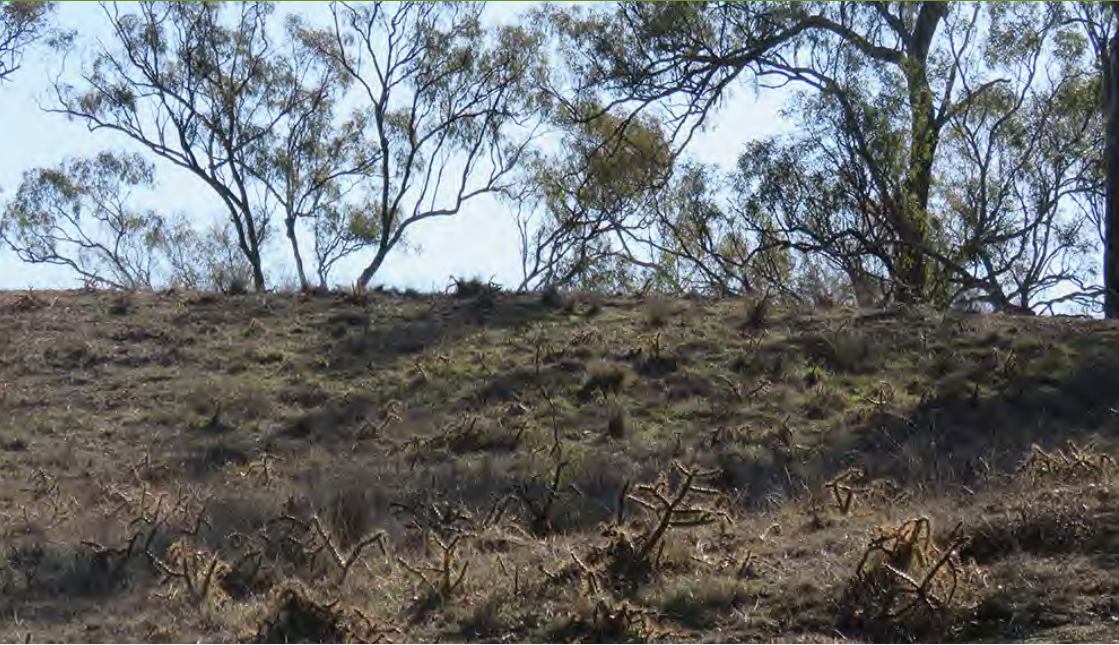
Tiger pear growing in a paddock.