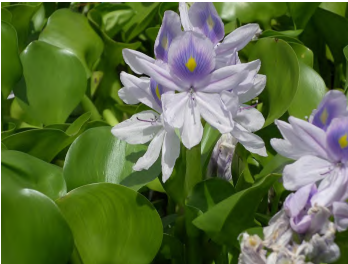
Purple flower with a yellow centre.