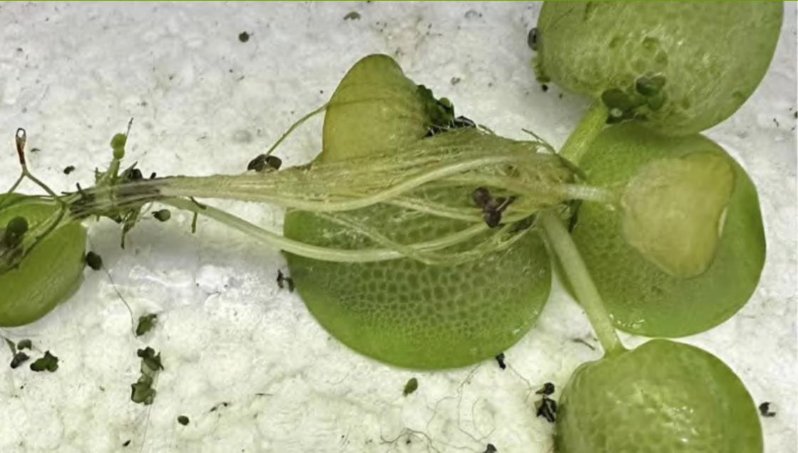
Underside of leaves showing air sacs