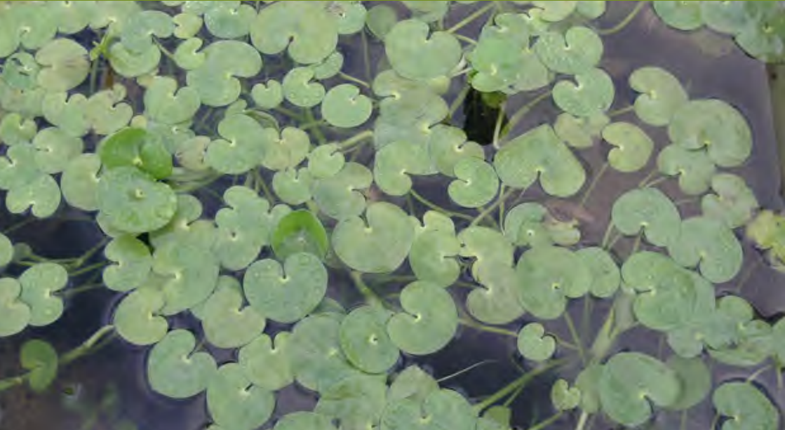
Mature Kidney-leaf mud plantain floating on water surface.