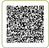
Weeds of National Significance (WONS)

Weeds of National Significance: Under the National Weeds Strategy, 32 introduced plants have been identified as Weeds of National Significance (WONS). These are regarded as the worst weeds in Australia due to their invasiveness and potential to spread, with significant economic and environmental impacts.