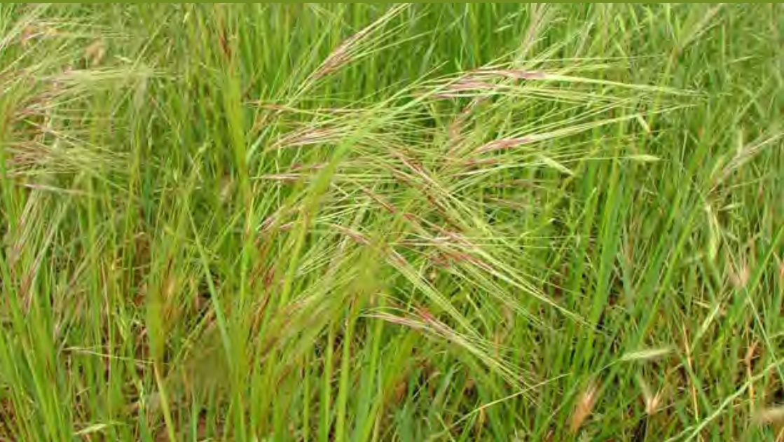
Chilean needle grass cluster growing in pasture.