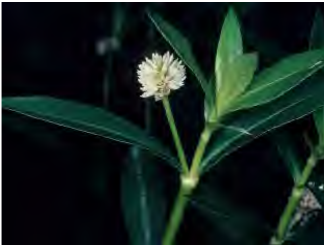
Plants have small white flowers in summer with opposite leaves and hollow stems.