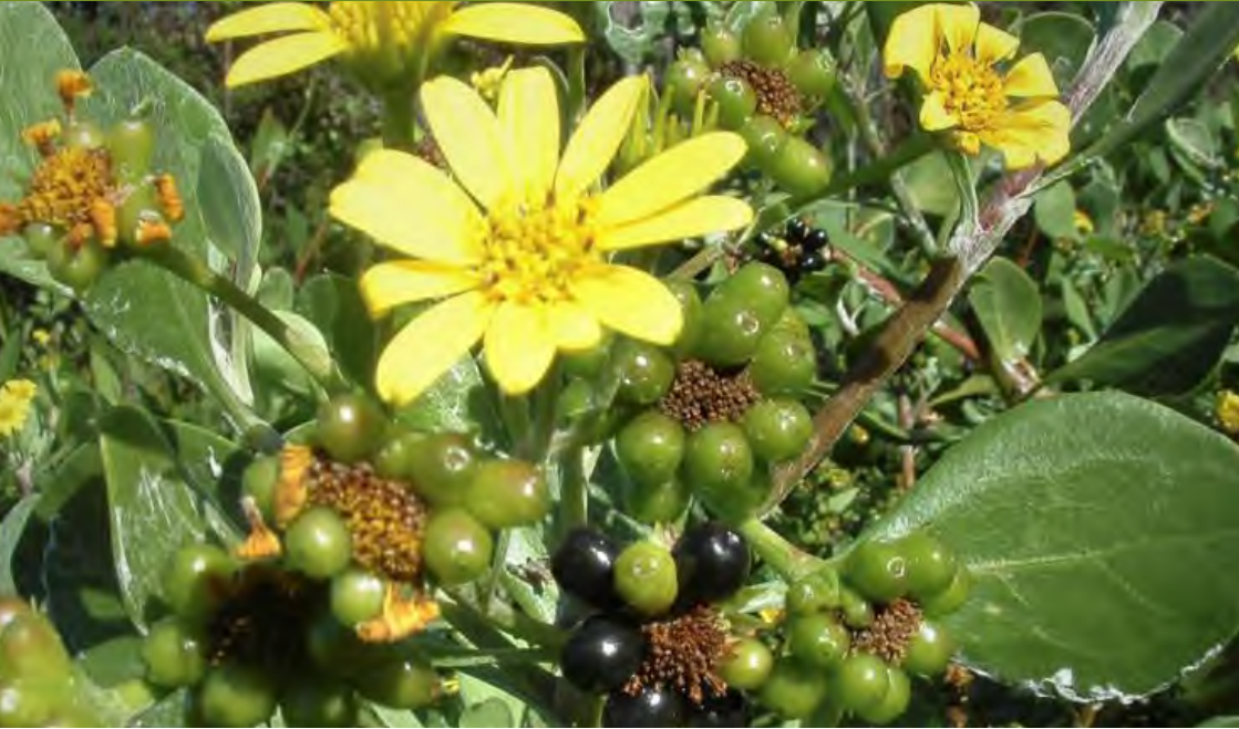
Bitou bush flower and seeds

Chrysanthemoides monilifera subsp. rotundata and monilifera