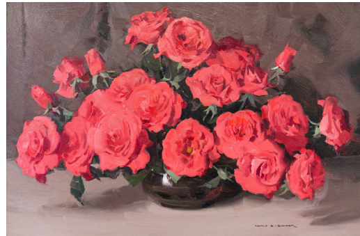
Red Roses in Brown Vase oil on board, 41 x 61.5 cm