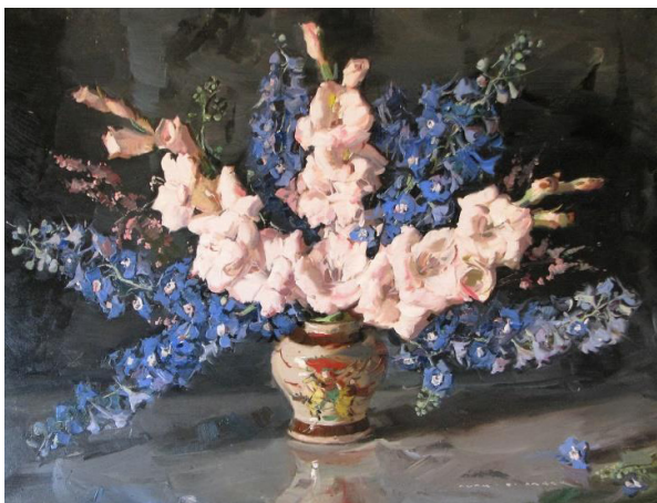
Gladioli oil on masonite board, 61 x 76 cm