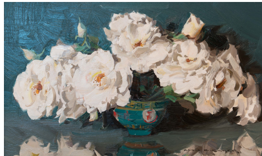
White Roses in a Chinese Bowl oil on board, 23.5 x 39 cm