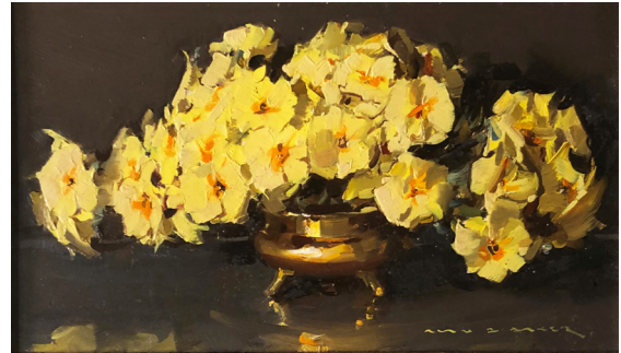
Primrose oil on board, 16.5 x 28.5 cm