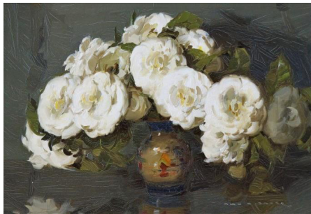
Contessa Calini Camellia oil on masonite board, 29 x 44.5 cm