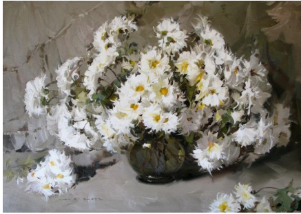
White Chrysanthemums oil on masonite board, 51 x 71 cm