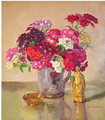
Phlox 1940, oil on masonite board, 35 x 30 cm