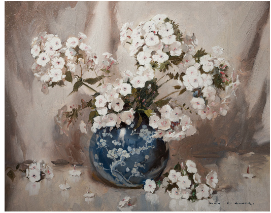
Perennial Phlox oil on masonite board, 60 x 75 cm