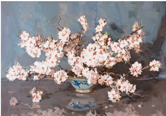
Almond Blossom oil on masonite board, 50 x 76 cm