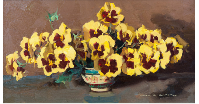
Pansies oil on masonite board, 20.6 x 38 cm