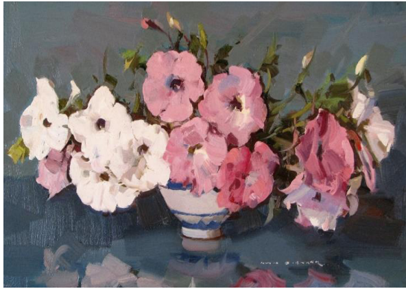
Petunias oil on masonite board, 25.5 x 40.5 cm