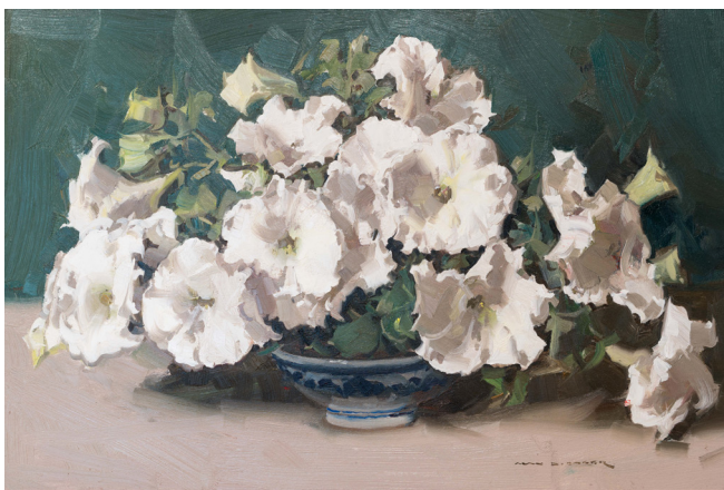
White Petunias oil on masonite board, 41 x 61 cm