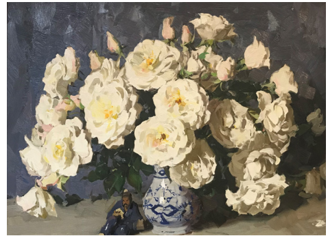
White Roses in a Chinese Vase oil on board, 49 x 59 cm