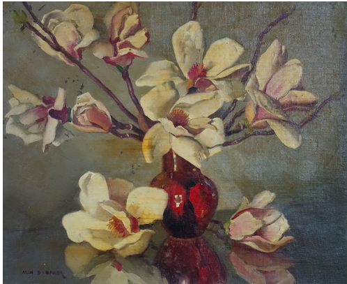
Magnolias oil on canvas, 35.5 x 42 cm