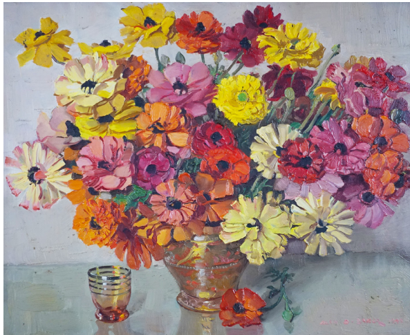
Zinnias in a Glass Bowl 1945, oil on board, 29.5 x 34.5 cm