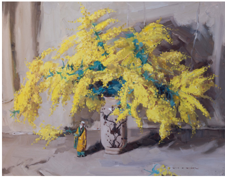
Wattle oil on masonite board, 61 x 76.5 cm