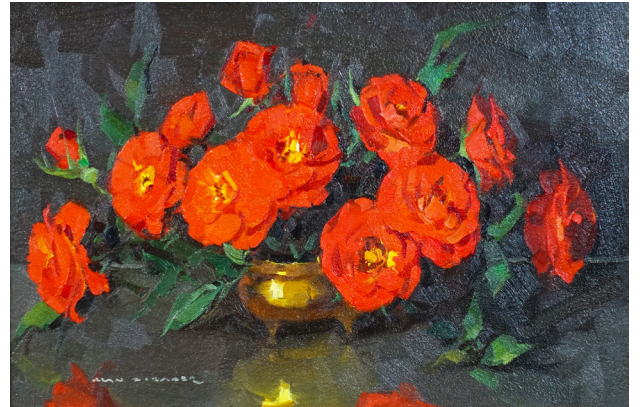
Red Roses 12 June 1987 (painted the day Baker died), oil on masonite board, 21.5 x 34 cm