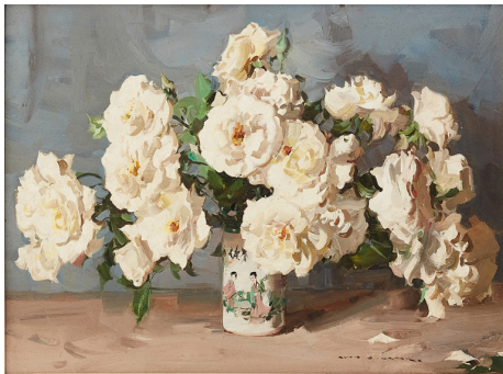
White Rose oil on board, 37.5 x 45.5 cm