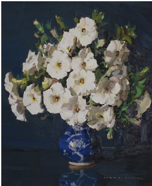
White Petunias oil on masonite board, 46 x 38 cm