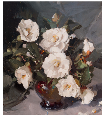
Wild Camellias oil on masonite board, 30.5 x 25 cm