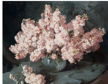
Pink Stocks oil on board, 61 x 76 cm