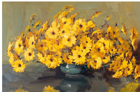
Yellow Daisies oil on canvas board, 48.5 x 74 cm