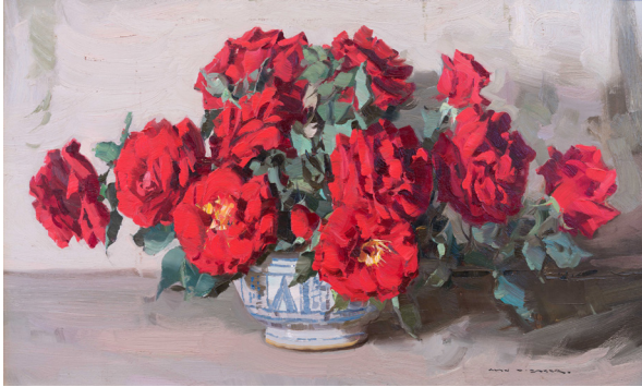
Red Roses oil on masonite board, 40.7 x 66.1 cm