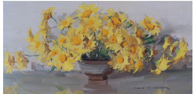
Yellow Daisies oil on masonite board, 19 x 36.5 cm