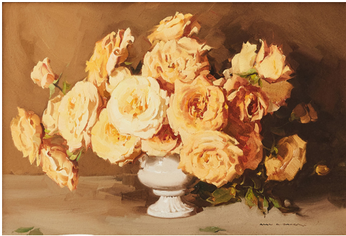
Apricot Roses oil on masonite board, 41.5 x 60.5 cm