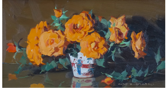
Apricot Miniature Roses oil on board, 20 x 35 cm