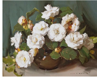
Camellia Alba Plena oil on masonite board, 36.5 x 44.5 cm