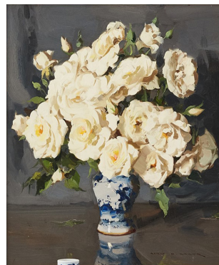
White Rose oil on board, 59.5 x 44.5 cm