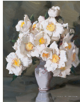
White Gordonias oil on masonite board, 37 x 29 cm