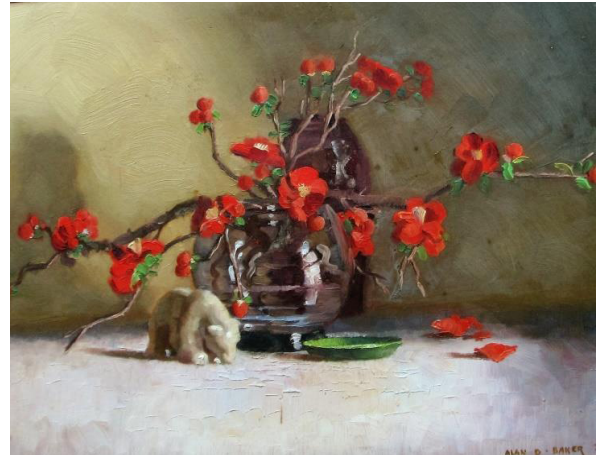
Amber Bowl Japonica oil on masonite board, 25.5 x 34 cm