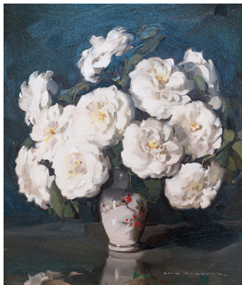
Contessa Calini Camellias oil on masonite board, 45.5 x 38 cm