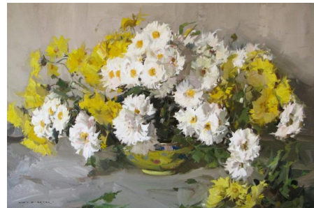
Yellow and White Chrysanthemums oil on masonite board, 51 x 76 cm