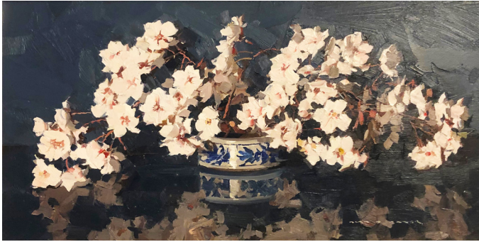
White Cherry Blossom oil on masonite board, 22 x 45 cm