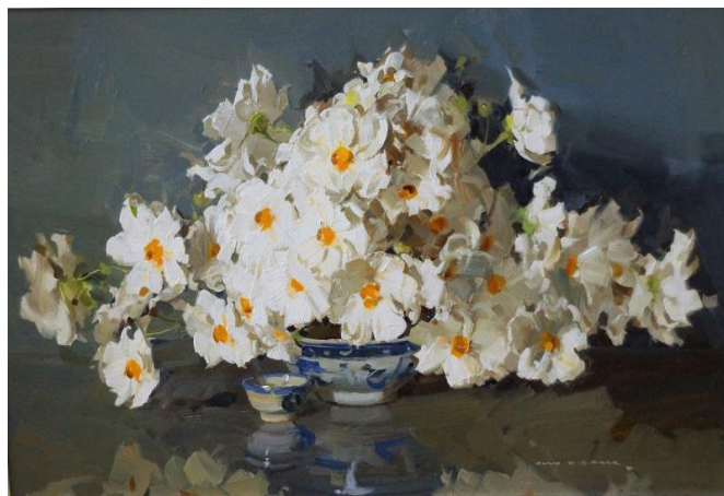
White Cosmos oil on masonite board, 40 x 60.5 cm