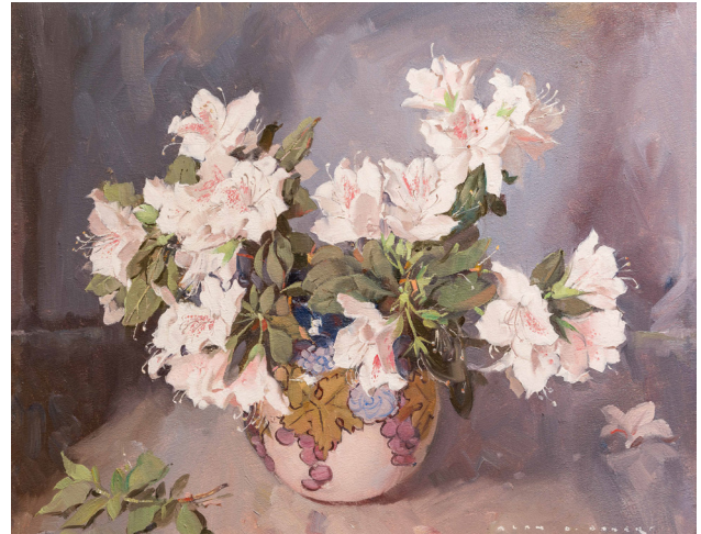
White Azaleas oil on board, 49.5 x 60 cm