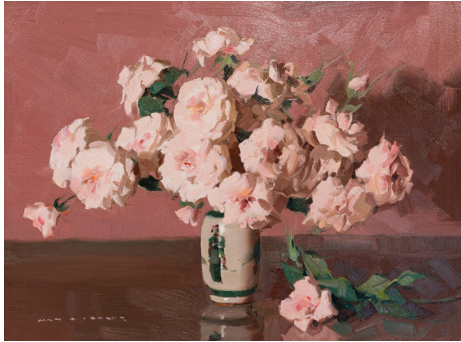
Cecile Brunner Roses oil on masonite board, 29.5 x 39.5 cm