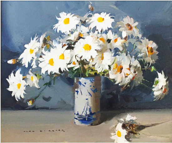
White Daisies oil on masonite board, 25.5 x 30.5 cm