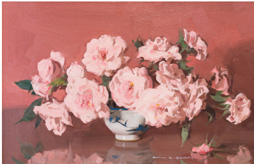
Cecile Brunner Roses oil on masonite board, 24 x 37 cm