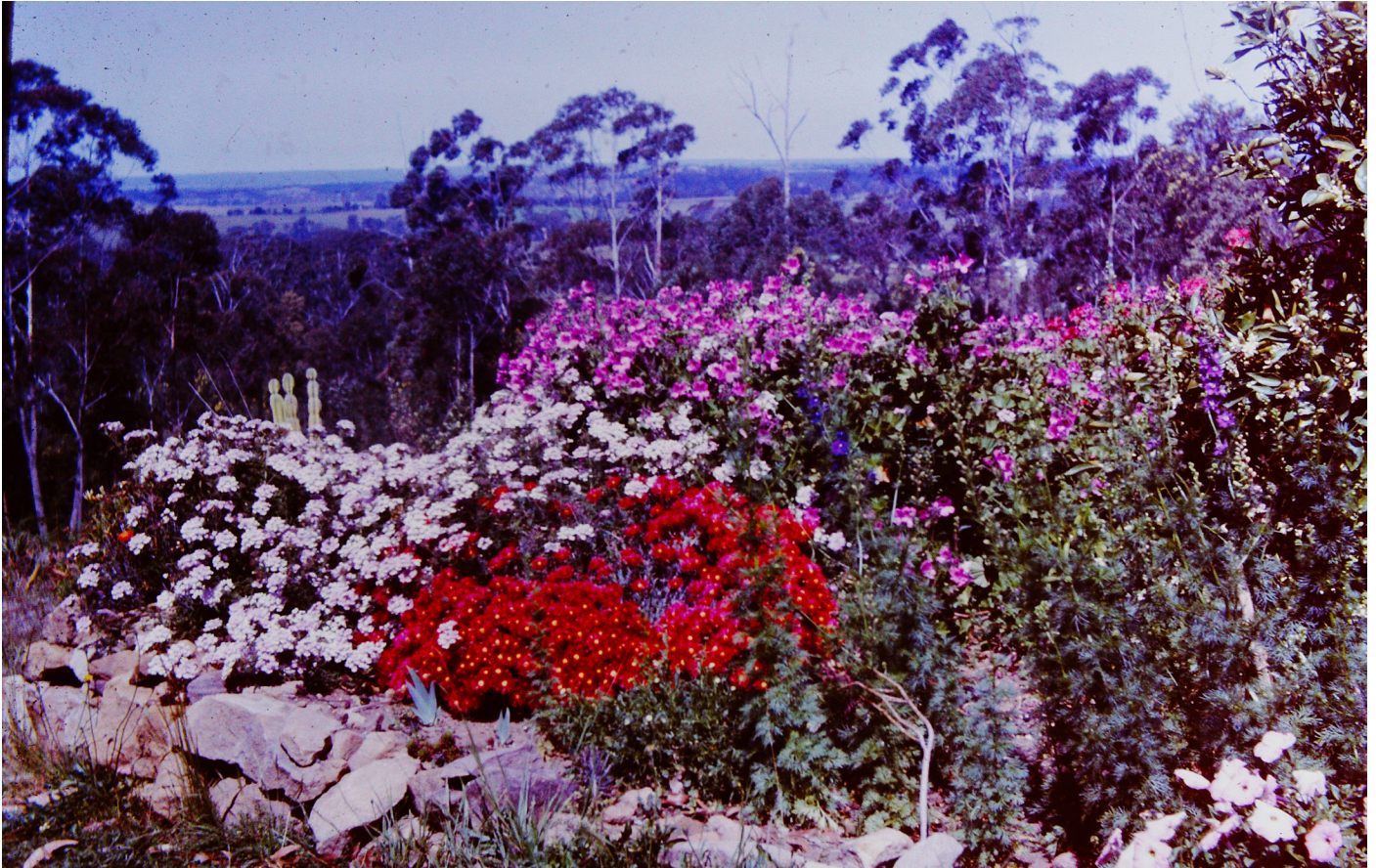
The Bakers' Belimbla Park Garden c1960s.