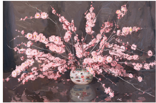
Peach Blossom oil on masonite board, 51 x 76.3 cm