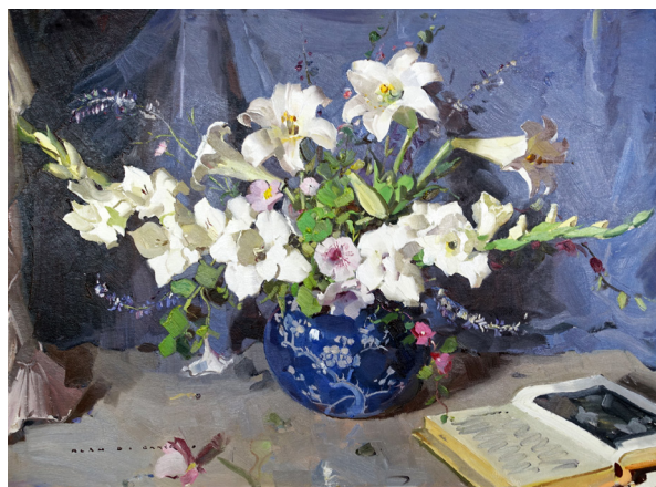
Lilies and Gladioli in a Chinese Vase oil on masonite board, 60 x 76 cm