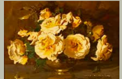
Lady Hillington Roses