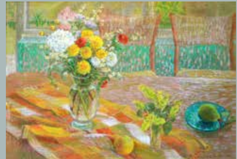
Composition Pastel, 1984