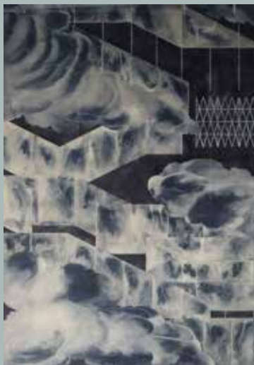
Shrine II, 1980 Max Miller

Oil on canvas, 70 x 50 cm CAP portait section winner, 1978