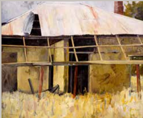
Down but not Out No.2