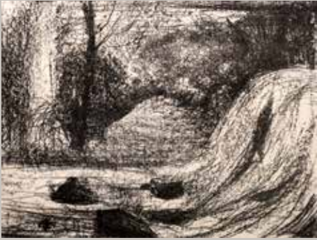
Rain Forest (Edition 15/50)