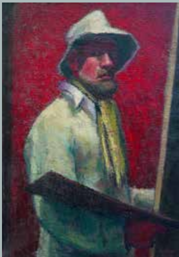
Portrait of the Artist Gordon Wolff

Oil on canvas, 70 x 50 cm CAP portait section winner, 1978