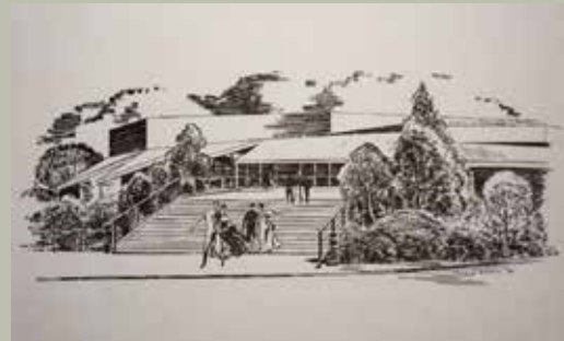
Camden Civic Centre