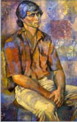
Young Man, 1981