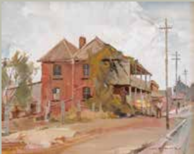
The Oaks Council Chambers