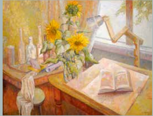
Studio Interior, with Sunflowers