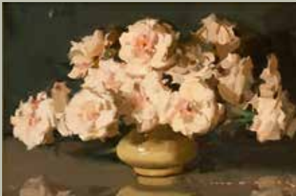
Cecile Brunner Roses