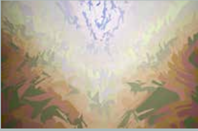
Valley at Dawn