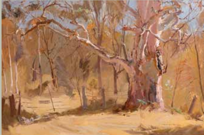
Sunshine and Shade