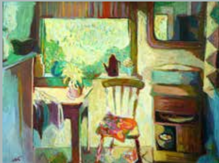
Sunlight in Kitchen