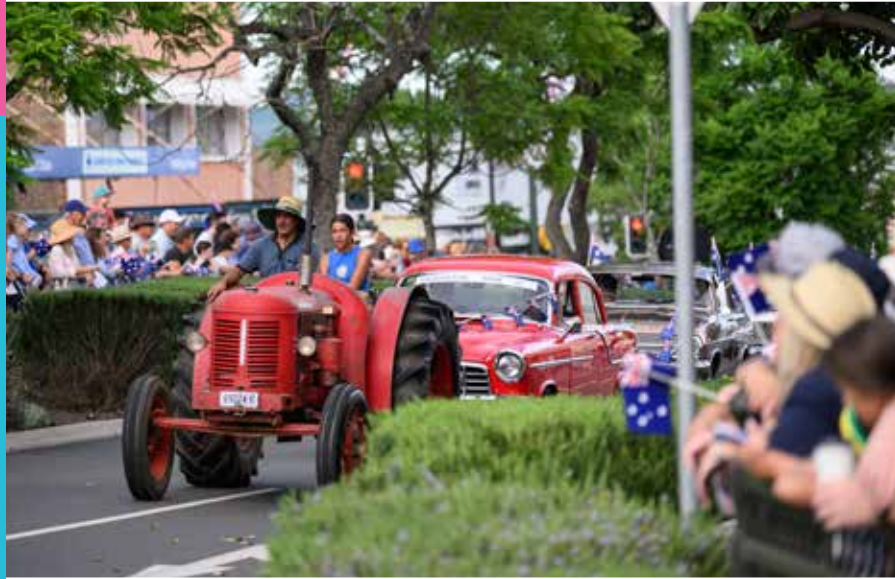
Mayor of Camden

I'm looking forward to a great 2024, where Camden continues to go from strength to strength. We had a fantastic year last year and I'm looking forward to an even better year this year!