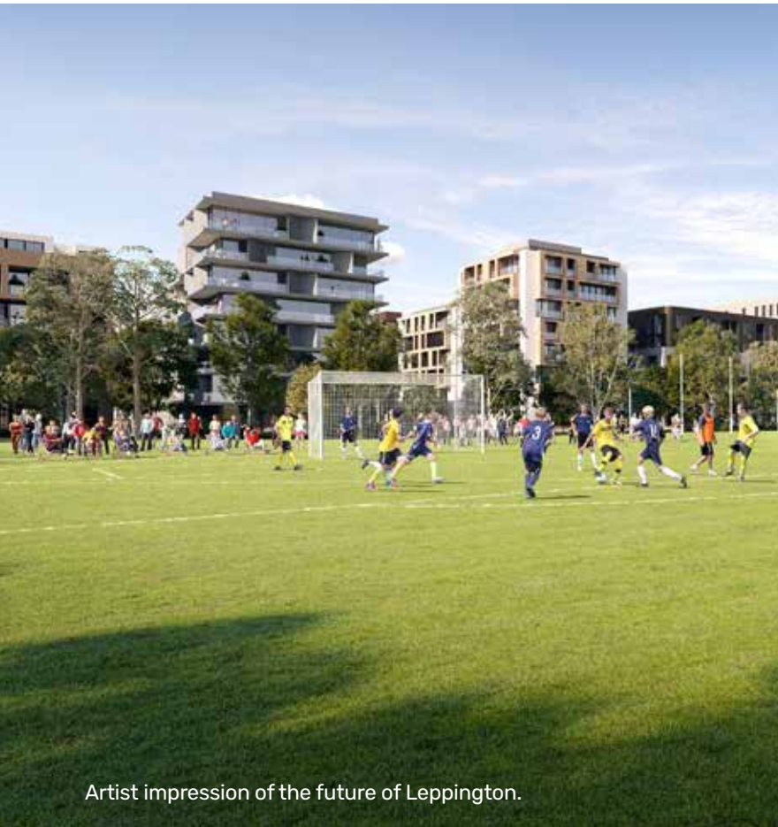
Artist impression of the future of Leppington.