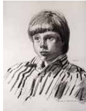
'Darren' 66 x 49.5cm