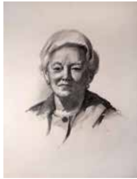
'Untitled' 64.5 x 50cm