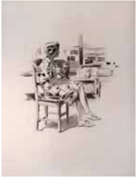
'Marjory' 64 x 48cm