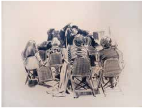
'Camden Art Group', 1976 45.5 x 75.3cm