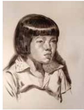
'? Lloyd' 65.5 x 50cm