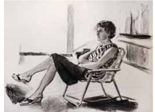
'Untitled' 65.5 x 50cm