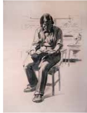
'Humpty Dumpty' 63.5 x 52cm