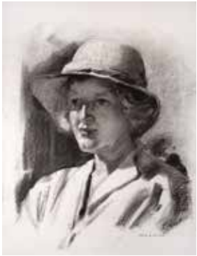
'Marjory' 65.5 x 50cm