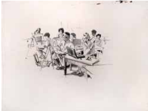
'Camden Art Group' 50 x 65cm