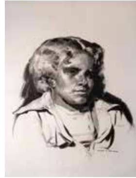
'Eddie' 65.5 x 50cm