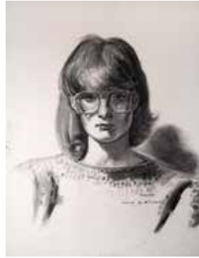
'Megan' 66 x 50cm