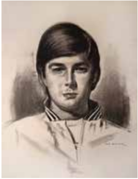
'Untitled' 65.5 x 50cm