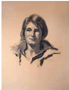
'Daphne Wilson', 1976 71 x 45.5cm