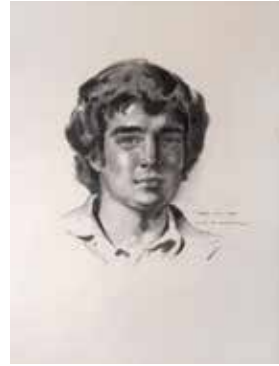
'Gary', 1973 66 x 48cm