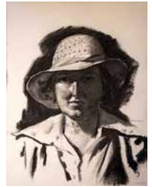
'Marjory' 65 x 50cm