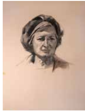
'Marjory' 63.5 x 48cm