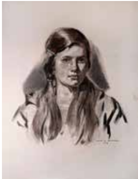
'Untitled', 1973 64 x 48cm