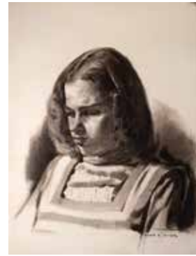
'Megan' 65 x 50cm