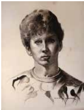
'Untitled' 65.5 x 50cm