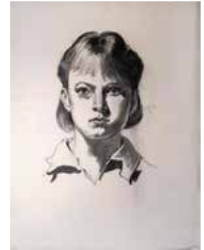
'Untitled' 65.5 x 50cm