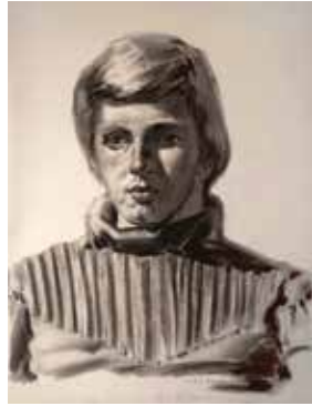
'Untitled' 65.5 x 50cm