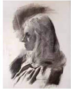
'Untitled', 1979 65.5 x 50cm