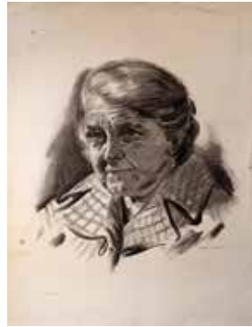
'Winn's Mother' 64 x 52.5cm