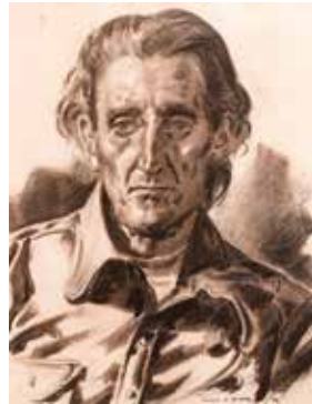
'The Lean Australian' 61 x 47cm