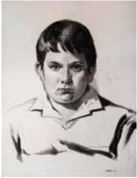
'Craig' 65.5 x 50cm