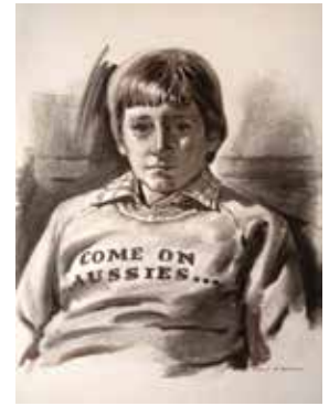
'Come on Aussies' 65.5 x 50cm