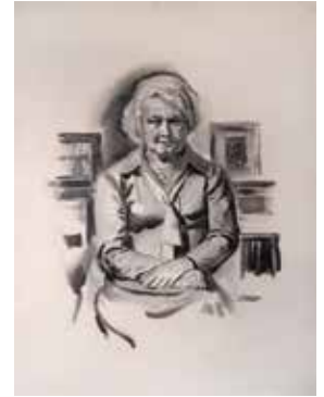
'Untitled' 65 x 50cm