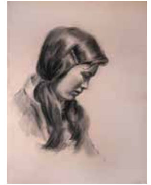
'Untitled' 63.5 x 48cm