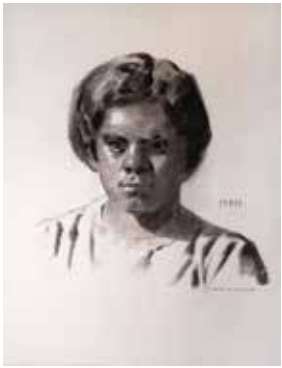
'Eddie' 65 x 50cm