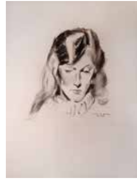
'Untitled', 1973 63.5 x 48cm