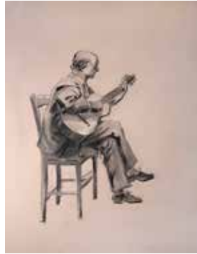
'Ken Rorke' 63 x 48cm