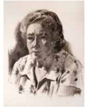
'Untitled' 65.5 x 50cm