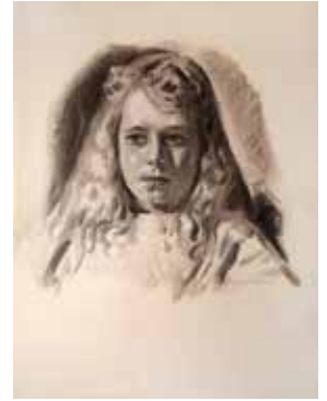
'Angelica' 65.5 x 50cm