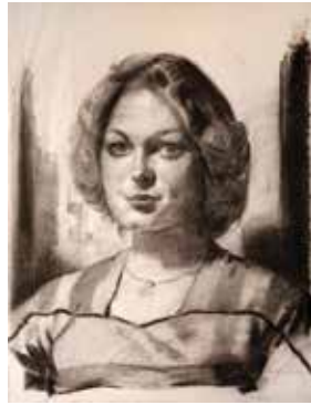
'Untitled' 65.5 x 50cm