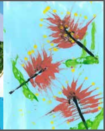
Artwork by Sophie, Nestle Bottle Brush