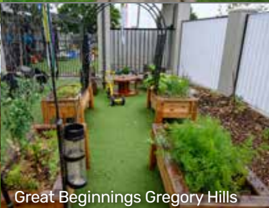
Great Beginnings Gregory Hills