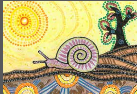
Artwork by Xavier, Cumberland Plain Land Snail